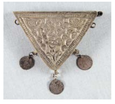
10. Box for inscriptions against diseases and spells, HMMF-521.

City of Zagreb; the Croatian Medical Association; and the Foundation of the Croatian Academy of Sciences and Arts.