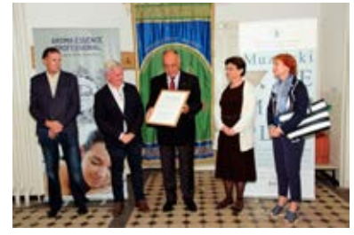
5. Exhibition opening at the Faculty of Pharmacy and Biochemistry of the University of Zagreb (Photo: Duško Ivan Granić).

visually followed the display of the first Croatian Museum of Medicine. The exhibition contained 323 items, described in 164 inventory inscriptions. The items were divided into the following thematic units: blood drawing kits; folk surgical instruments and their descriptions; folk medications of mineral, herbal and animal origins; amulets, apotropaic items and jewellery for protection against diseases and spells; Christian votive items: medallions – protection charms, holy pictures, votives, Christian inscriptions; Muslim inscriptions