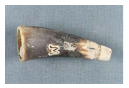
Blood drawing horn, HMMF-458.