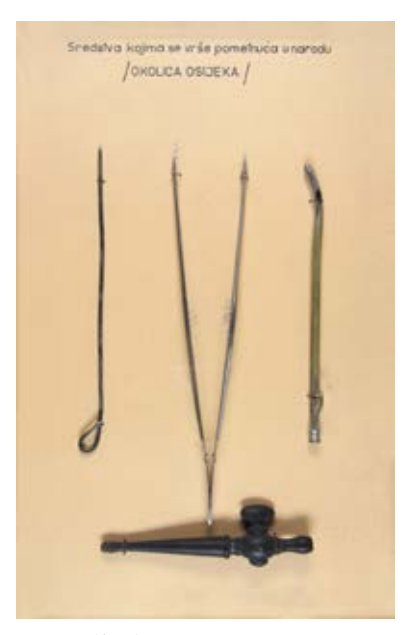
6. Folk abortion instruments, Osijek surroundings, 1942, HMMF-564 (Photo: Goran Kos).