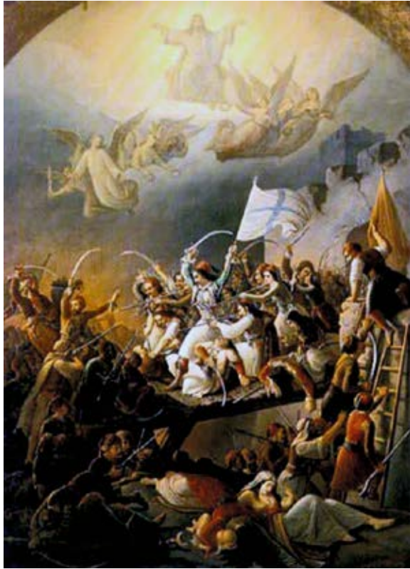
Figure 3 - The sortie from Missolonghi by Theodoros P. Vryzakis, 1855 (National Gallery and Alexander Soutsos Museum, Athens Greece)

after the cessation of publishing of the “Greek Annals” on February 20, 1824 and which was unfortunately lost. A monument to him is found in the Garden of Heroes in Missolonghi.