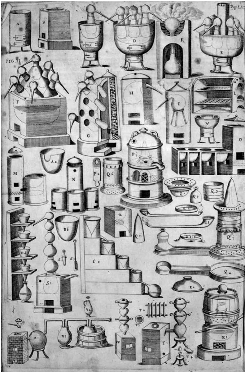
Figure 2 - Table illustrating pharmaceutical instruments from the Universale teatro farmaceutico of Antonio De Sgobbis (In Venetia, presso Paolo Baglioni, 1682). Courtesy of the Biblioteca Medica Interaziendale "P.G. Corradini", Reggio Emilia

Slika 2 - Prikaz farmaceutskih alata iz Universale teatro farmaceutico Antonio De Sgobbisa (u Veneciji, tisak Paolo Baglioni, 1682.). Biblioteca Medica Interaziendale "P.G. Corradini", Reggio Emilia