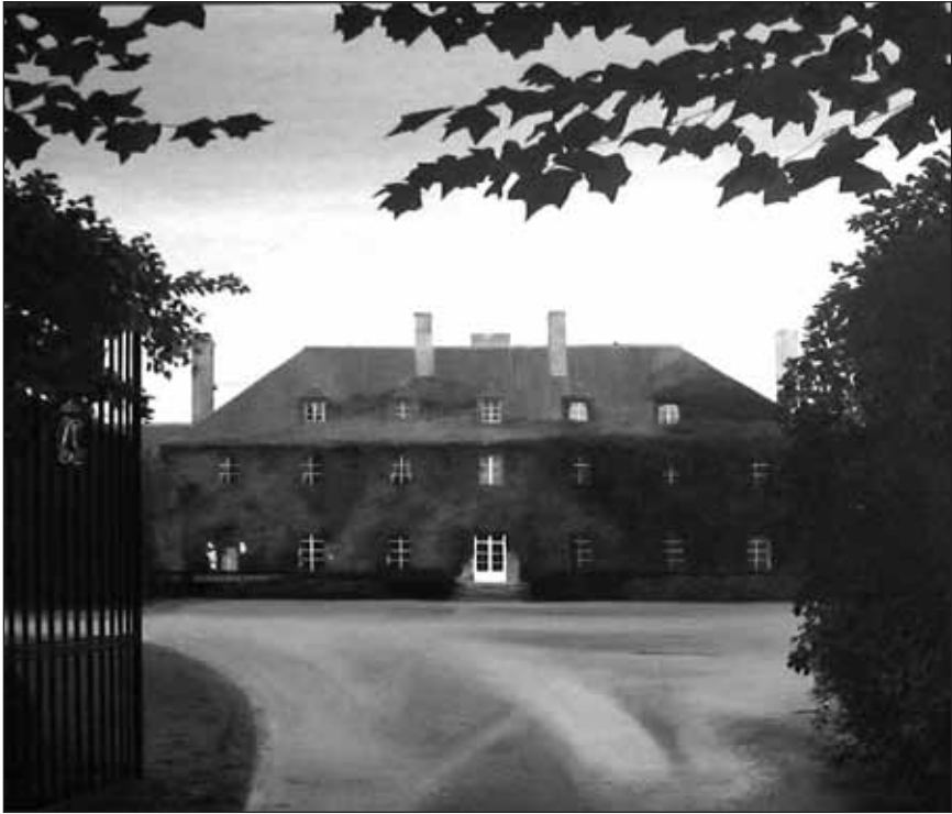
Figure 9. The Castle of Argenteuil (unknown painter) “Musée communal de Waterloo”

Slika 9. Dvorac Argenteuil (anonimnoga autora), Musée communal de Waterloo