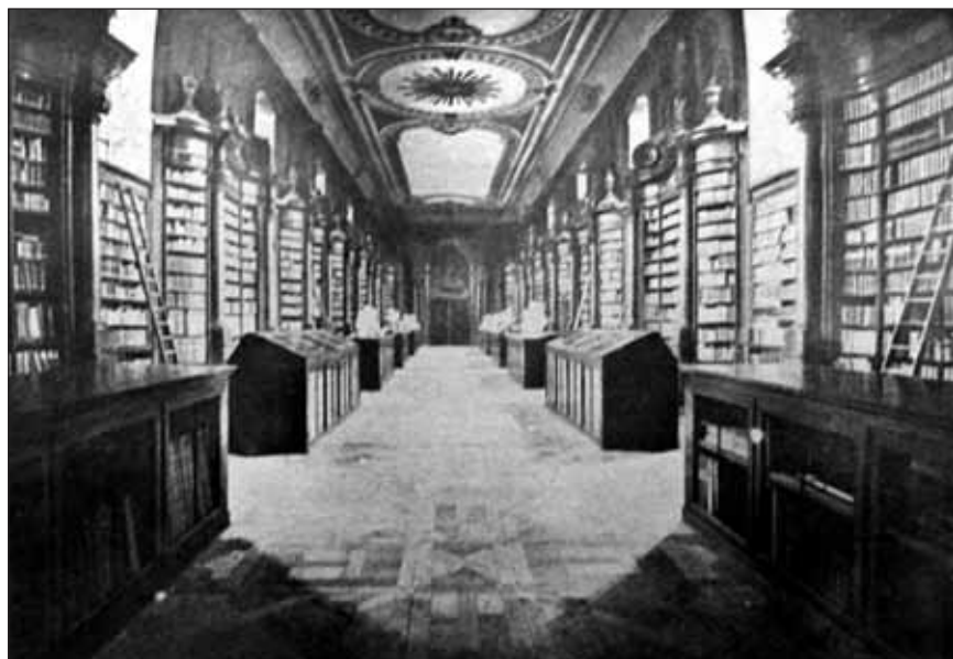
Figure 1 - University Library of Leuven before the fire of 1914

Slika 1. Sveučilišna knjižnica u Leuvenu prije požara 1914.