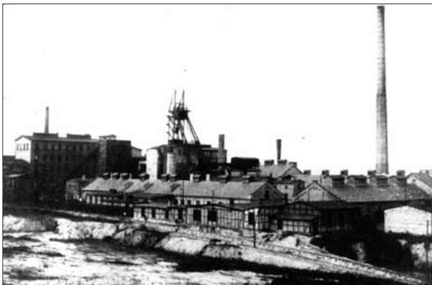
Figure 5 - Potassium factory of Wansleben between 1930 and 1936, by courtesy of Paul Reinhardt, Wansleben am See

Slika 5. Tvornica kalija u Wanslebenu između 1930. i 1936., ljubaznošću Paula Reinhardta, Wansleben am See