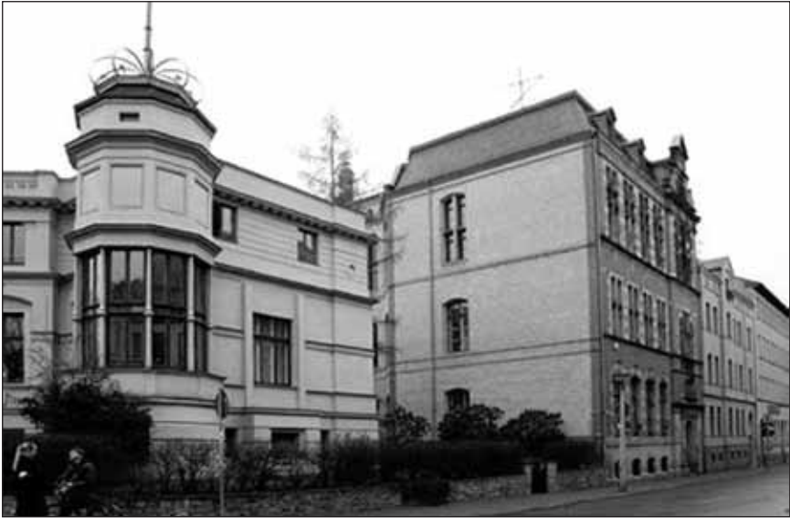
Figure 4 - Leopoldina of Halle