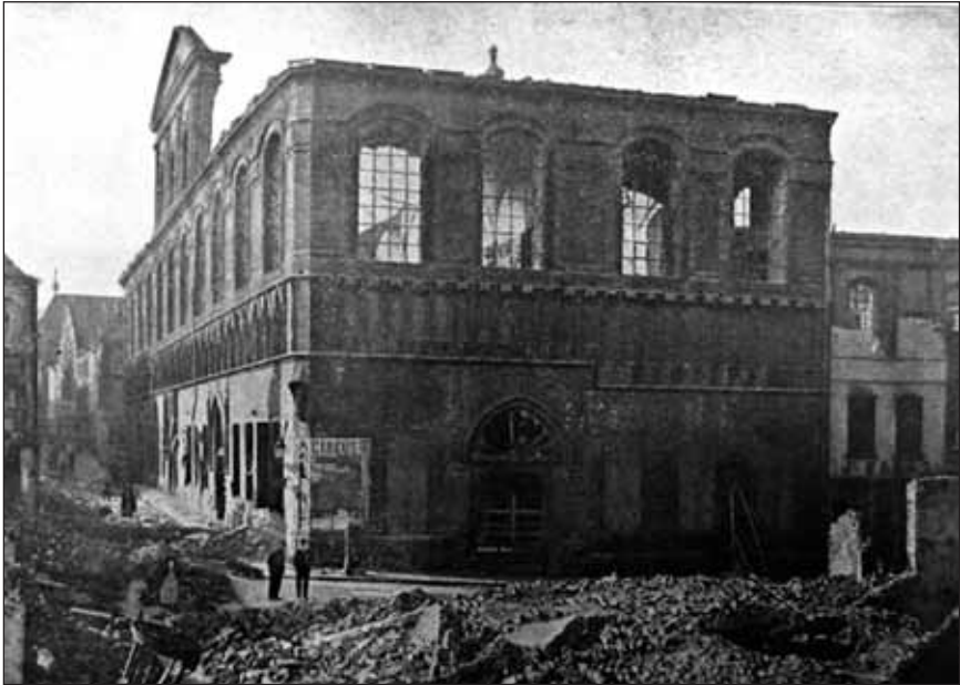
Figure2 - University Library of Leuven after the Fire of 1914

Slika 2. Sveučilišna knjižnica u Leuvenu nakon požara 1914.