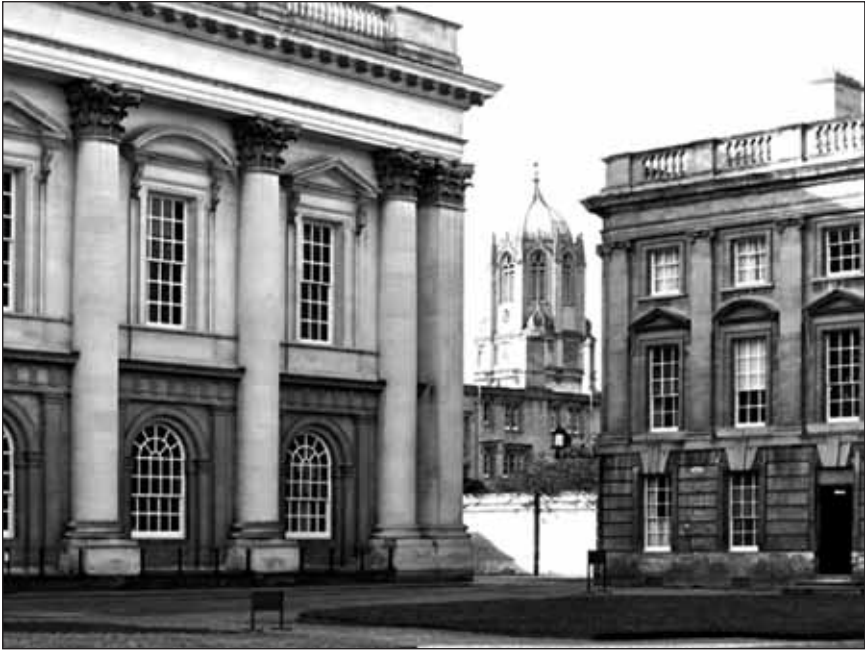
Figure 7. Christ Church College (Oxford, UK), by courtesy of Ralph Williamson, photographer.