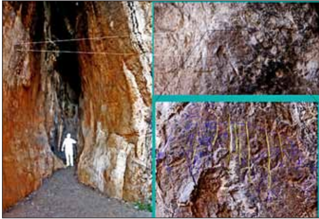
Cavillon Cave, depiction of a horse in profile

Pećina Cavillon, crtež konja iz profila.