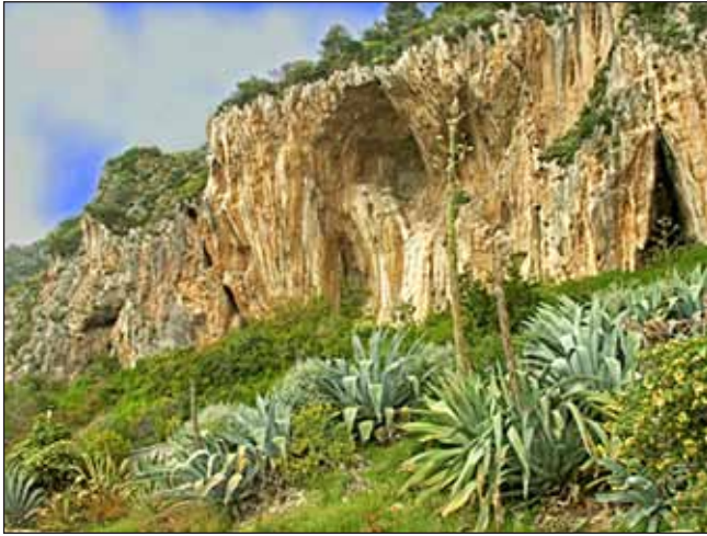
Vaults for the dead in Balzi-Rossi cliffs at Grimaldi (Italy).

Grobnice u hridinama Balzi-Rossi na obroncima nalazišta Grimaldi (Italija).