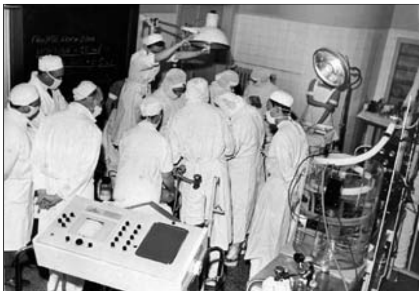
Figure 2 Preliminary experimental team work on dogs in 1957 before the first open heart operation in Ljubljana