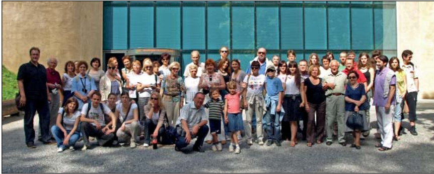
Tour group before the Krapina Neanderthal Museum Sudionici izleta ispred Muzeja krapinskih neandertalaca