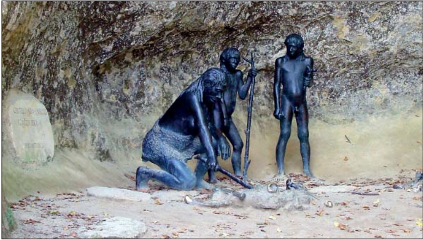
Krapina Man family in the Hruševo cave. Prikaz obitelji Krapinskog pračovjeka u polupečini Hruševo

world's largest collection of items from the Neanderthal times (Figure 4). The excavated artefacts included Mousterian-style flint tools (spikes, scrapers and daggers) belonging to a culture that knew how to use fire. The site is estimated to go back to the Palaeolithic, some 130,000 years ago.