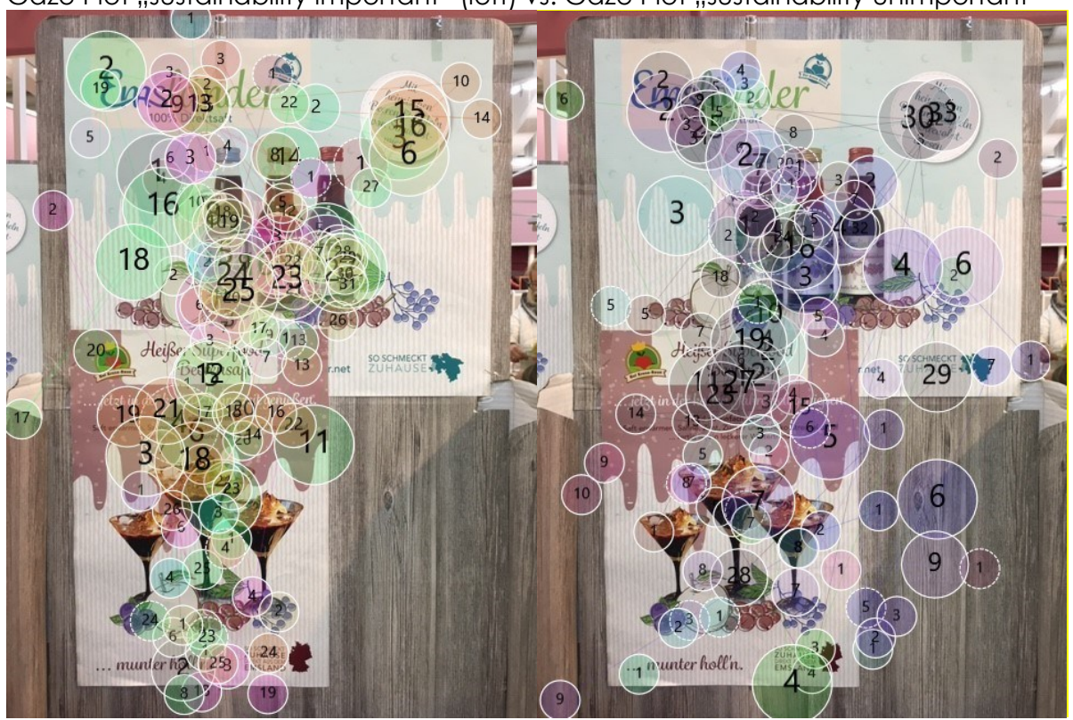
Figure 3 Gaze Plot "sustainability important" (left) vs. Gaze Plot "sustainability unimportant"

Note: left: illustration of the gaze plot "sustainability important" (n=17), right: illustration of the gaze plot "sustainability unimportant" (n=15)