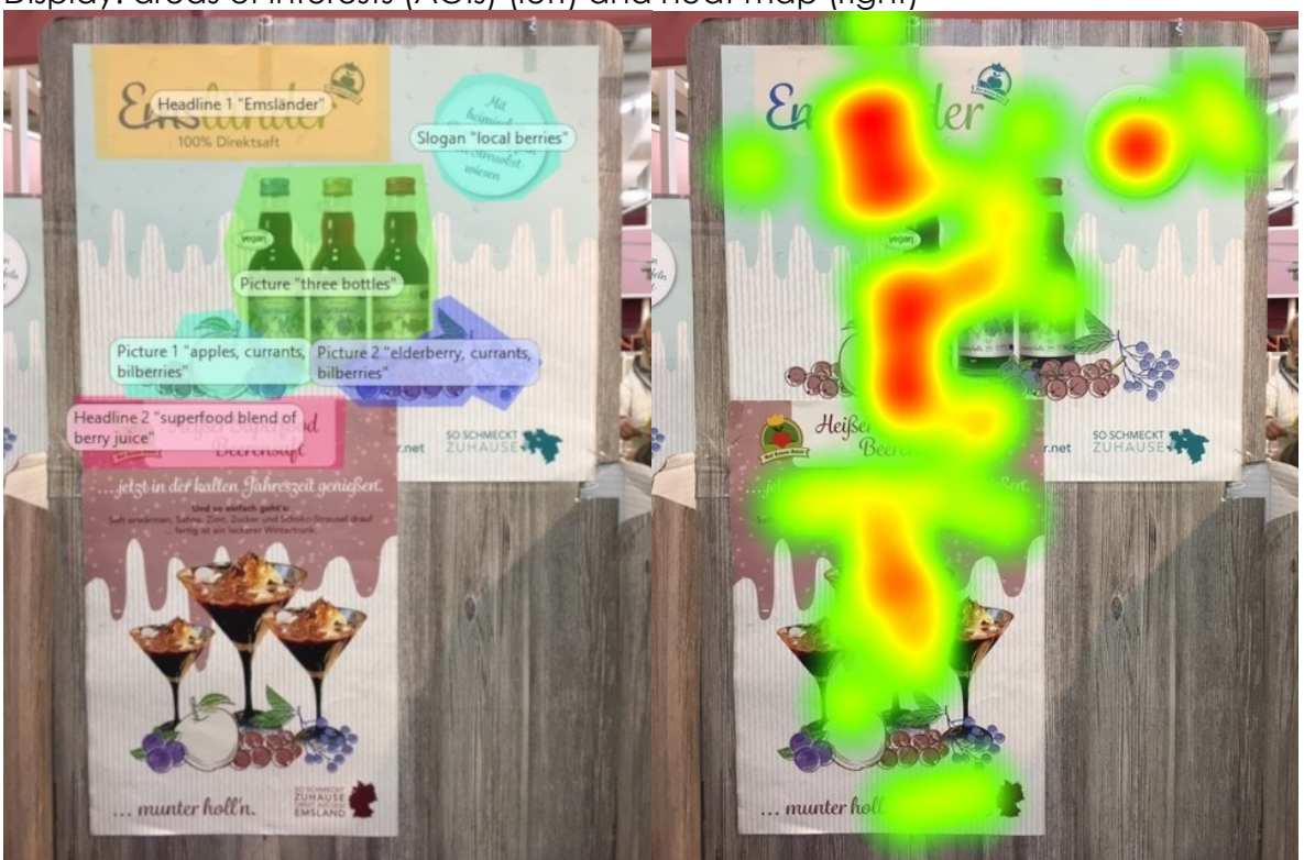
Figure 2 Display: areas of interests (AOIs) (left) and heat map (right)

Note: left: representation of the 6 AOI's, right: absolute duration is calculated by the duration of fixations, whereas the warmest colour represents the highest value.