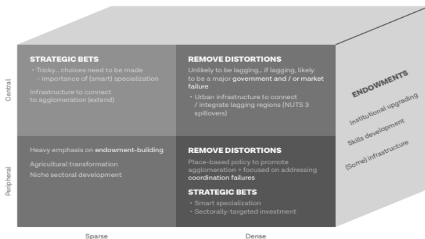
Figure 1 Templates of policy approaches in lagging regions

Source: Farole, T., Goga, S., Ionescu-Heroiu, M., (2018), “Rethinking Lagging Regions: Using Cohesion Policy to deliver on the potential of Europe’s regions”, International Bank for Reconstruction and Development/The World Bank, Washington, DC, available at: http://pubdocs.worldbank.org/en/739811525697535701/RLR-FULL-online-2018-05-01.pdf (Accessed on: October 9, 2019)