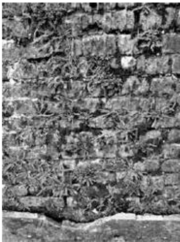
Figure 2 Unintentionally/spontaneously created wild green wall infrastructure (image on the left) in Osijek, Croatia and intentionally created and designed green infrastructure - Rozanno Shopping Centre, Italy (image on the right)