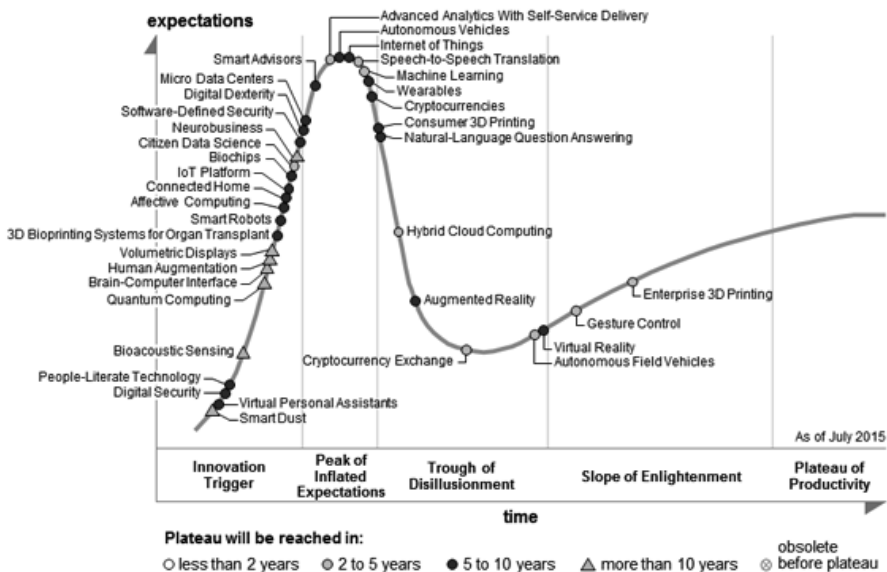
Figure 3 Gartner's Hype Cycle (2014)