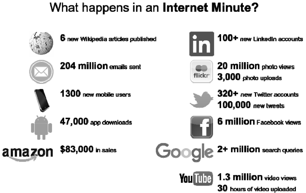
Figure 1 What happens in an Internet minute?