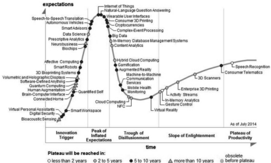
Figure 2 Gartner's Hype Cycle (2014)