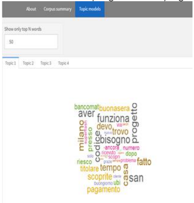
Figure 3 Second tab about topic generated by algorithm

The second tab is about topic comparison (Figure 3.). Here we can see top 50 words/terms for each topic which are visualized by word cloud. We have also input filter which is interactive and users can change preferred number of words in word cloud.