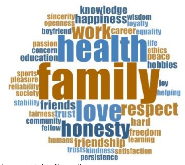
Figure 3 Students' Priority Values in Life

We were also interested in students' values. As presented in figure 3, the results show that the values that students mentioned the most in our study are the following: 28 students reported "family", 19 students "health", 14 students mentioned "love", 10 students "honesty", 9 students "work", 8 students "respect" and 4 students "friends" and "happiness".