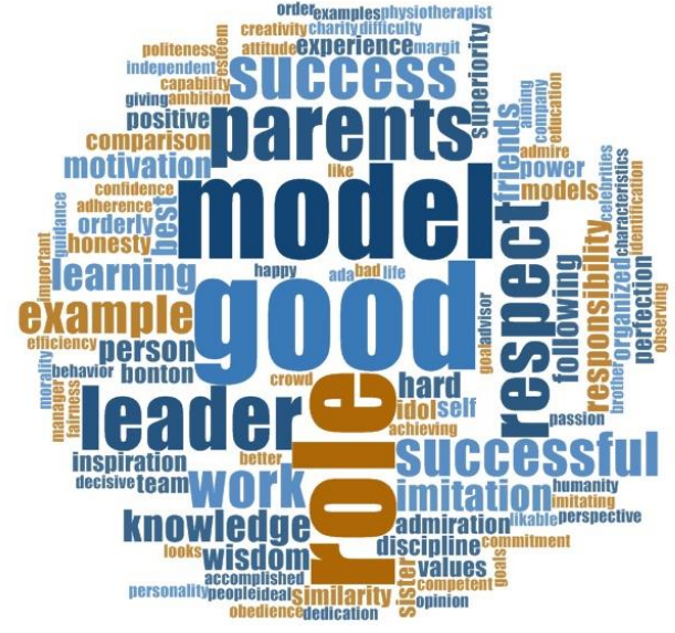
Figure 1 Students' Associations About Role Models

As presented in the figure 1, the most often named associations were: "good" when asked about their association about "role-model", as data shows that 16 students reported that, 15 students mentioned name "role", 14 students "model", 9 students "leader" and "parents", 8 students "respect" and 7 students "success".