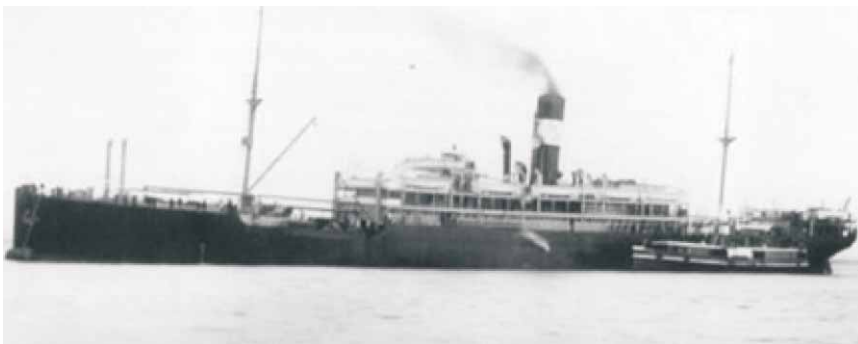
Picture of SS Waratah from Wikipedia: http://en.wikipedia.org/wiki/Image:Waratah1909.jpg

1909: South Indian Ocean. On July 29 while en route from South African's Durban to Cape Town, the British SS Waratah disappeared on her return maiden voyage from Sydney to London. No trace of the ship or any of the 211 passengers and crew were ever found, a freaque wave was always suspected in this case. (Source: http://en.wikipedia.org/wiki/Waratah_(ship) )