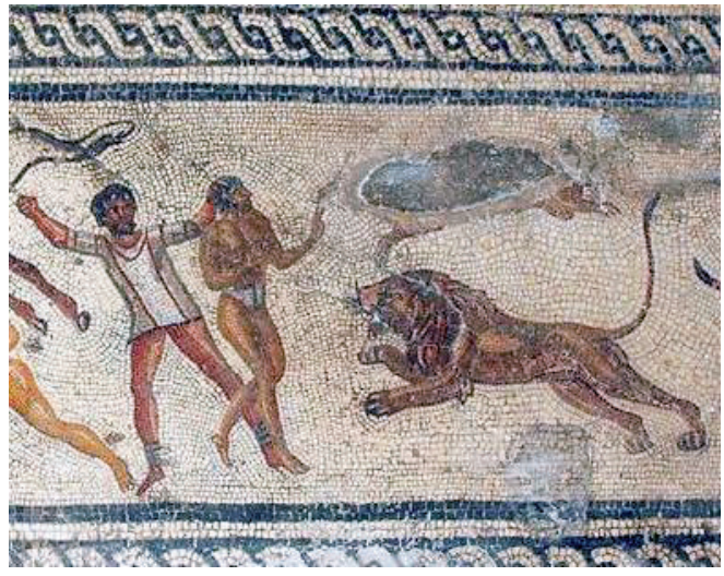
Picture 10. Scenes of the bestiarius in battle from the "Villa Dar Buc Ammera" mosaic, Tripoli Archaeological Museum, Libya

The name arena comes directly from the Latin word for "sand", called harena , because gladiators fought on sand. <sup>24</sup> The first public fights of gladiators were organized in the Forum Boarium and Forum Romanum in Rome, and later circuses, theatres and areas for chariot races were used to stage fights between gladiators. This is supported by findings throughout Europe. In Ephesus (Turkey), the theatre, only some 900 m southwest of the gladiatorial cemetery, contains finds that show the presence of gladiators, and the same processes can be recognized in theatres in Athens, Aphrodisias, Assos and Hierapolis. <sup>25</sup>