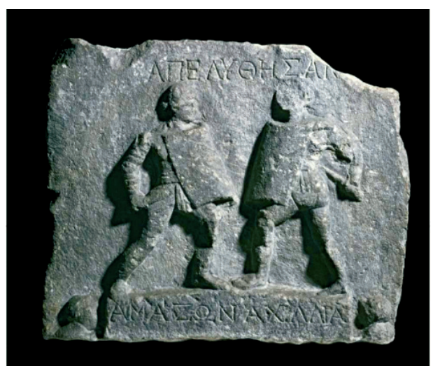
Pictue 6. A marble slab depicting two women gladiators, British Museum

and shields. The right gladiator's head is missing, and they are standing on a raised platform and, in the bottom, on each side, is the spectator's head. Female gladiators are depicted with the same equipment as male gladiators, but without helmets. There are rare findings like the ones mentioned above that talk about female members of this cruel sport, but it is known that the Roman emperor Septimius Severus banned women gladiators in the year 200.<sup>16</sup>