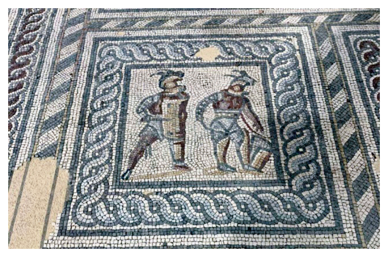
Picture 12. A gladiator lowers his shield to admit defeat, Augusta Rauric, Switzerland

The peak of constructing edifices, in connection with the gladiatorial games, will come from 70 to 80 AD, when the Amphitheatre of the Flavians, better known as the Colosseum , will be built. The arena, with 50,000 seats, offered an unprecedented view of gladiatorial games, animal fights, historical land and sea battles. Although the Colosseum was used earlier, in 80 AD, Vespasian's son Titus opened the Colosseum with a grand program of games that allegedly lasted 100 days and led to the death of 5,000 animals. <sup>27</sup>