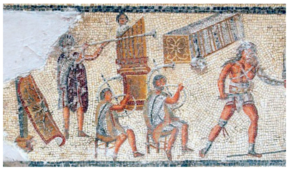
Picture 11. Scenes of gladiators from the "Villa Dar Buc Ammera" mosaic, Tripoli Archaeological Museum, Libya

theatre was changed in the imperial period, the stone amphitheatre in Pompeii, which dates back to around 70 BC. BC, is the oldest preserved stone amphitheatre in the world. In 29 BC, the Roman senator Titus Statilius Taur financed the construction of the stone amphitheatre in Rome. As the Roman Empire expanded, so did the amphitheatres, and with the popularity of gladiator fights, they would become the main entertainment venues in the cities. Over time, this form of entertainment and construction would spread throughout the Roman Empire, from the Mediterranean to the British Isles.