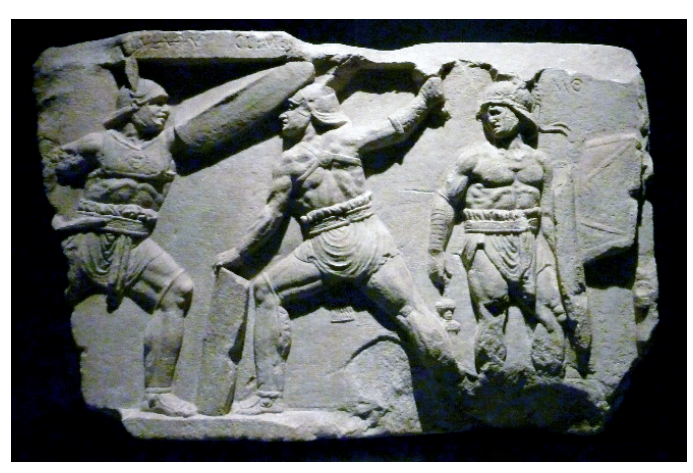
Picture 8. A relief of a tombstone with the depiction of two provocators from the time of the Republic. Rome, around 30 BC

The provocator - whose name means "challenger", was equipped in much the same way as the murmillo : with a helmet, a rectangular shield, an arm guard and armour. His main weapon was a short sword. Inscriptions mentioning this type of gladiator are known from Rome (Anicetus and Pardus), Pergamum (Nympheros) and Pompeii (Mansuetus). <sup>21</sup>