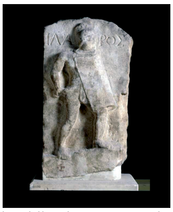
Picture 1. A gladiator relief from Halicarnassus, 1st century, Turkey, British Museum

From the end of the Roman Empire, many centuries will pass on the European soil, until the rediscovery of the same topics that the Romans dealt with, as well as the progress of law, economy, architecture, urbanism, art and the military. Thus already in the Renaissance, art will look for inspiration in ancient works, and with the arrival of the period of historicism, this process will suddenly expand, when there had been a greater number of archaeological excavations and finds. With each discovery of a new and unknown find, the interest in antiquity did not weaken, but on the contrary, fascination and interest among professionals and ordinary people only grew. Among all the valuable and artistic objects, records and stories found, one form of entertainment is probably the most popularly researched topic of ancient Rome. It is about the most famous "sport" in Rome – the gladiatorial fights.