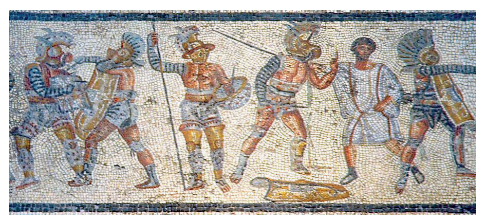
Picture 4. Scenes of gladiators from the "Villa Dar Buc Ammera" mosaic, Tripoli Archaeological Museum, Libya