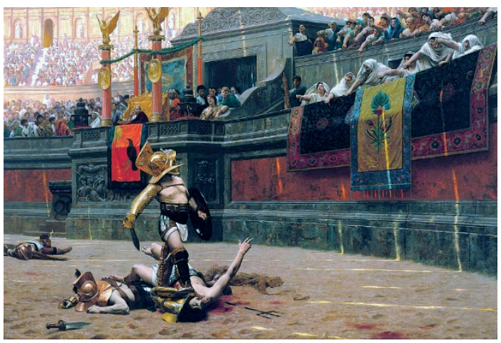
Picture 13. Jean-Léon Gérôme, "Turned Thumb" (Pollice Verso), Phoenix Art Museum