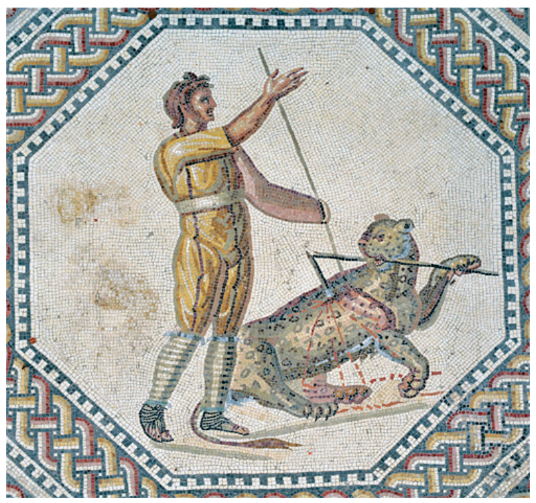
Picture 7. An illustration of the Bestiarius from the mosaic from Villa Nennig, Austria

of these fighters. Each type is characterized by a certain advantage, as well as a different choice of equipment. The oldest known types are certainly the Samnite and Thracian , and, in addition to the above, the four most famous types include the murmillo and the retiarius . Below are the types of gladiators, along with certain characteristics.