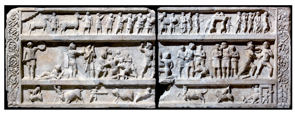
Figure 2. A relief with gladiators, 20 - 50, National Archaeological Museum in Naples, Italy

The following theory also says that gladiatorial fights originally had a sacred character. The theory is based the belief that Roman soldiers, after their death, were honored with the sacrifice of prisoners of war and similar manifestations were carried out by the Greeks and Etruscans. Similar considerations are made by the early Christian writer Tertullian in his work De spectaculis , writing: "The ancients thought that with this kind of spectacle they were doing a favour to the dead, after they softened it with a more cultural form of cruelty... Because from ancient times, they believed that the souls of the dead were propitiated with human blood, at funerals they sacrificed captives or slaves of poor quality that they had bought... So they found solace for death in murder." According to this theory, the practice of simple sacrifices grew into a mutual fight to the death, which would eventually grow into gladiatorial combat.