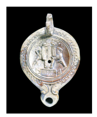
Picture 3. A terracotta lamp depicting two gladiators 51 - 100, British Museum

We can also add a theory that says that the gladiatorial games arose from the development of public events in Rome that included activities