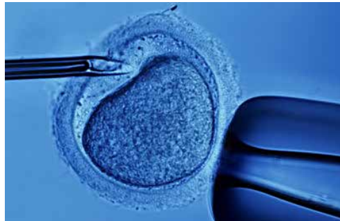
Figure 5: In vitro fertilization; Source: http://static.ddmcdn.com/gif/in-vitro-fertilization-2.jpg , (7. April 2014.)

In vitro fertilization is the most drastic measure to be taken when a child cannot be conceived. Very carefully an egg cell and a sperm are selected and put together in a controlled environment, and with a little luck a child is born approximately nine