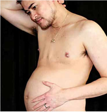
Figure 4 : Thomas Beatie; Source: http://www.huffingtonpost.com/2008/03/31/pregnant-man-new-photos-r_n_94250.html , (7. April 2014.)

Can a man get pregnant? Yes he can. How? Thomas Beatie had a hormone treatment and surgeries, and is now officially a male, but his gonads were not removed so he can still have children.