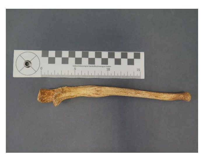
Figure 4: Well healed fracture of the left ulna in the female from Grave 24.

Bone fractures were recorded in at least four individuals (two of the fractures, the humerus and the rib from Grave 3 come from the same mass bone assemblage, making it impossible to tell whether they belonged to just one or two different individuals). In total, three long bone fractures, one rib fracture and one frontal bone