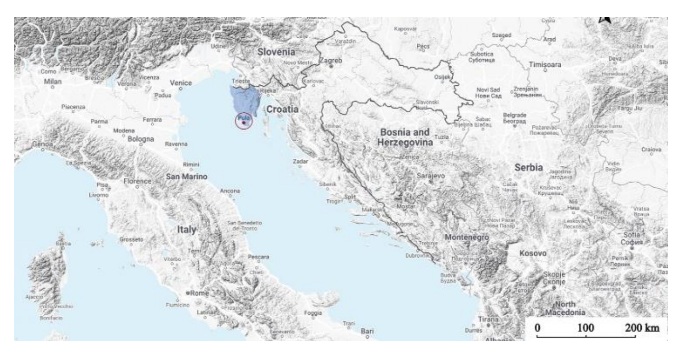
Figure 1: The location of Istria County (blue) in Croatia and Pula (circled in red). The map was generated using the online web tool Snazzy maps (Krogh, 2019) and edited in Krita software (version 5.0.6).

create a picture of individual, but also communal health (Manifold, 2014).