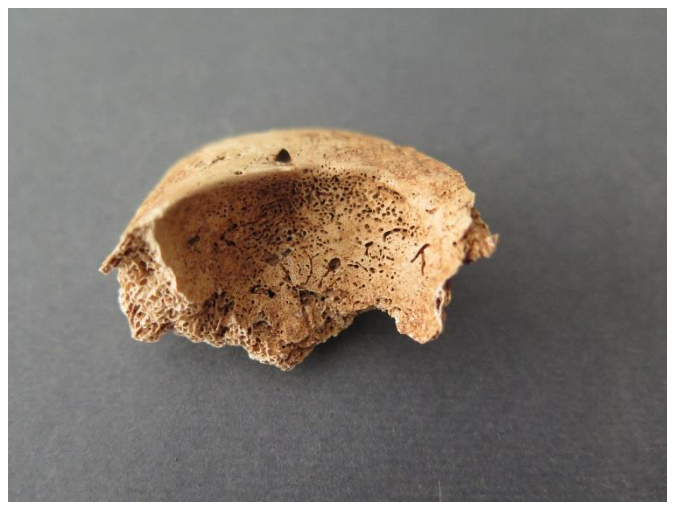
Figure 3: Active cribra orbitalia in the right orbit of the subadult from Grave 7.

Periostitis occurs in six out of 24 subadults (25%) and does not occur in adults, thus representing 12.5% (6/48) of the total Pula sample. In all cases, periostitis was in