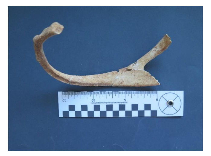
Figure 5: Bifid rib in the male from Grave 15.

Two individuals in the Pula skeletal sample had bifid ribs. In both cases, the rib anomaly is unilateral and on the left side of the individual's body. In the case of the male from Grave 4, the bifid rib is the sixth left rib with the thickening and bifurcation of the sternal end of the rib. The sternal end is completely split into the inferior and superior arm of the rib. One male individual (Grave 15) had the bifurcation of the fourth left rib (Fig. 5). The rib is also completely split at the sternal end into an inferior and superior arm.