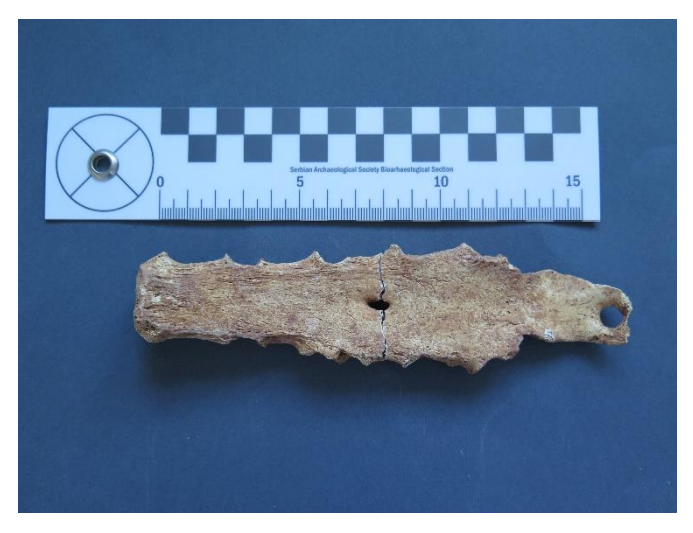
Figure 6: Sternum of the male from Grave 15 with multiple sternal foramens and the xiphoid process fused with the body of the sternum.

the xiphoid process is fused with the body of the sternum.