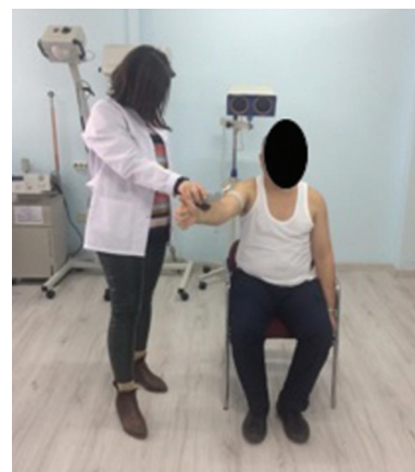
Figure 2. Measurement of the isometric strength of shoulder abduction

To measure the isometric strength of shoulder abduction, we positioned the shoulder at 90° abduction in the scapular plane and external rotation (thumb pointing up) and the elbow at full extension (Figure 2). The bubble inclinometer was attached to the arm to ensure 90° shoulder abduction. After the explanation of the test, the participant performed one sub-maximal test for familiar-