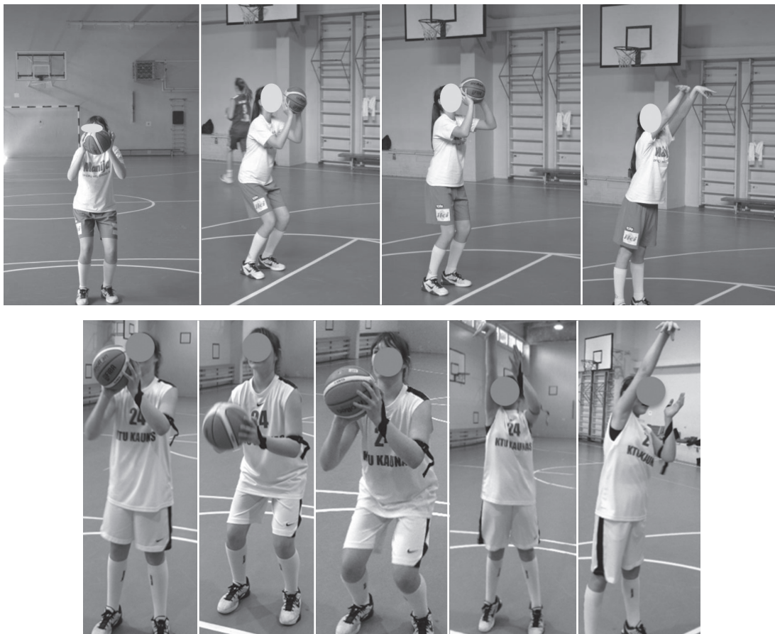
Figure 1. Sequence of photos showing the free throw technique without (upper images) and with the use of shooting straps (lower images).

coordinated to perform free throws with his/her mind clear of pressure and external information (Ambery, 1996). The result of the test was quantified as the number of successful shots expressed as a percentage of all the shots attempted. The exact same procedure was repeated after the intervention training in order to test the short-term effect of a shooting strap (after one month of practice). The retention of the shooting skill was tested one year after the intervention (long-term effect). In the test training sessions the players performed the same routine with warm-up activities and the free throws test (25 minutes). Afterwards, they continued with their training tasks and drills focused on tactical and technical aspects of the game (60 minutes). The tests were supervised by two expert coaches (observers to gather the data) with clear instructions of no interaction between them and the players. Then, the players received the initial information about how to do the tasks (free throws tests), but no feedback or support (i.e., emotional, performance-related, social) were given during the tests. The coaches' feedback was only given after the training session. Its focus was on the improvement of free throw effectiveness with the emphasis on its importance during games and competitions (performance perspective), but not on the test performance. No emotional information was offered to the player