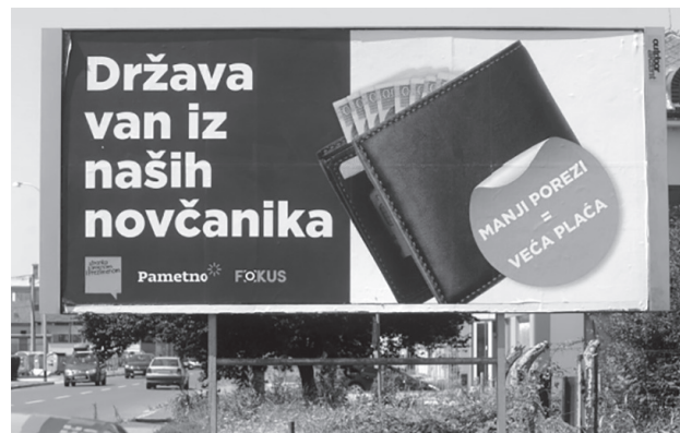
Figure 2. Pre-election billboard slogans by Stranka s Imenom i Prezimenom , Pametno , FOKUS 11

The slogan “Croatia is awaking” also had a pragmatic and a strategic function, since its creators highlighted only the positive and desirable features of the political agenda through the conceptual image of the awaking (cf. Štrkalj Despot 2016). On the other hand, some researchers (Marot Kiš and Palašić 2012) indicate that it is more appropriate to describe the primary function of a metaphor in political discourse as deceptive, because many politicians produce catchy slogans to conceal the actual state of affairs, whilst designing an illusion that they have control over the situation. In this sense, the authors of the other slogan “Get the state out of our wallets” used quite the opposite technique, representing the social situation so that it appears as close to reality as possible and in order to depict the Croatian state as the enemy of its citizens, stealing their money.