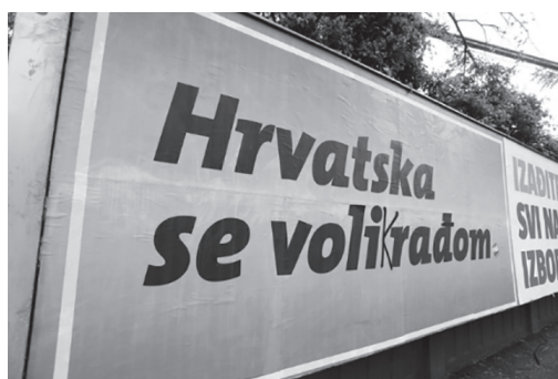
Figures 3. and 4. Pre-election billboard slogans by the Croatian People's Party – Liberal Democrats 12

Although the discourse strategy used in the creation of this slogan was based on evoking the specific emotion that has political relevance (Chilton 2004: 204), judging from the written reactions of unnamed authors who graffitied the billboards, the effect was the very opposite. Stressing that Croatian working people feel love for their country was not viewed favourably by some of the citizens; rather they were annoyed and irritated by the slogan. Figure 3 shows a graffito proposing that “love for the Croatian people should be shown by giving them better salaries”; and in Figure 4, the word radom (“working”) was changed to krađom (“stealing”) suggesting political cynicism behind the slogan’s original message. In both cases, citizens’ discontent with the socio-economic situation in the country is evident, as well as their perception of the existence of corruption sponsored by the state.