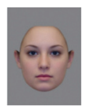
Figure 2. Female prototype face in two versions – high facial sexual dimorphism (feminine, right) and low facial sexual dimorphism (masculine, left).

For the purpose of previous study (52) each prototype was transformed by ± 50% of the shape differences between symmetrical male and female prototypes in order to appear more feminine and more masculine using standard computer graphics methods (56). In this way, four prototype faces were created: masculine woman (low facial sexual dimorphism), feminine woman (high facial sexual dimorphism), masculine man (high facial sexual dimorphism) (for more information on the transformation procedure, see 51). These prototype faces, presented in Figures 1 and 2, were then used in the present study as a same-sex rivals in hypothetical situations of partner's emotional and sexual infidelity.