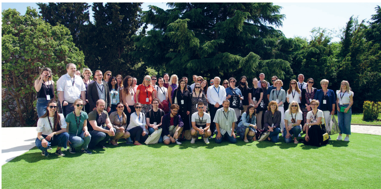
Figure 4. The participants of the 4 th Croatian Microscopy Congress held in Poreč, 2022.

HMD is not what it used to be, and that is perfectly fine. It shouldn't be. Young people have the strength to realize new ideas and provide new content, and that is what drives science forward. Society itself is doing well, and nothing fundamental should be changed. It made a huge step forward with the inclusion of different fields and in terms of membership numbers. Many people mean many new ideas, but we