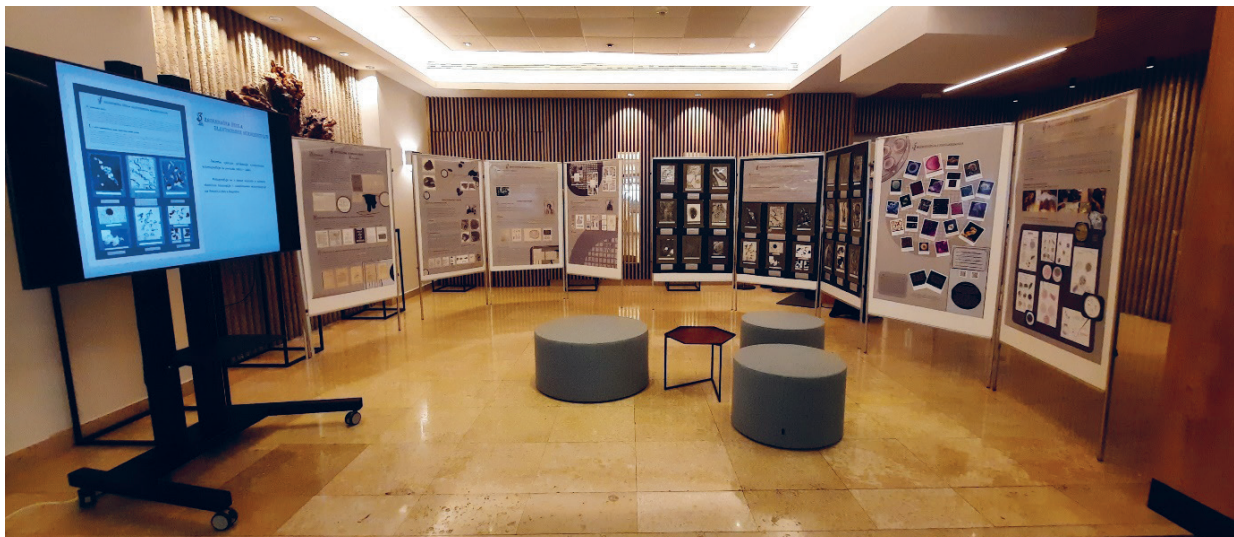
Figure 3. The exhibition "From first to modern microscopes" dedicated to the history of Croatian microscopy.