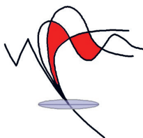
Figure 2. The logotype of Croatian Microscopy Society.

It is worth mentioning that the Society's logotype (Figure 2), created by Ognjen Milat, Ph.D. , in 1995, has remained unchanged. The logo is a drawing composed of straight and wavy lines representing the radiation of photon and electron beams and spectra, shaped to represent the map of Croatia. The ellipse with a horizontal line in the middle represents the glass lens symbolising a microscope. For the full story on this logo, visit HMD's website.