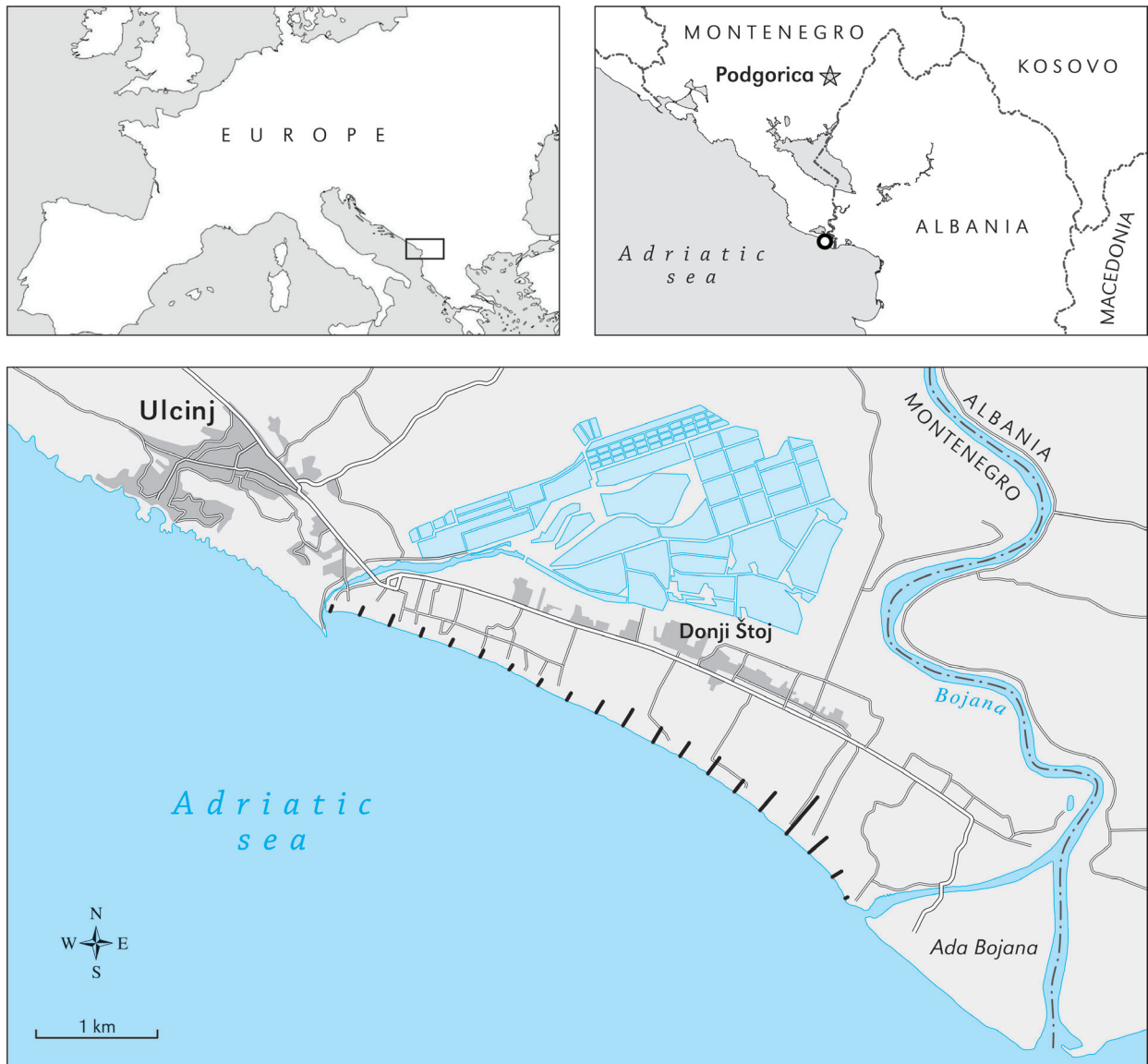
Figure 1. Location of the studied Velika plaža (Montenegro).

tem, with forest vegetation. We also analysed plant communities of interdunal depressions and humid slacks, which are often overlooked in similar studies. For the longest transects, which had large homogeneous areas of singular plant communities, the quadrats were placed 20 m apart from each other along the transect (and not contiguously). In each quadrat, the cover of plant species was visually estimated on the Braun-Blanquet scale (41). Since transects were performed in the late spring and early summer of 2015, when Erigeron canadensis L., E. sumatrensis Retz. and Oenothera species are just starting to germinate, it was not possible to identify this species. Identification was therefore left at the genus level. For the area, the following Oenothera taxa were reported: O. × fallax Renner, O. glazioviana Micheli, O. biennis L., and O. suaveolens Pers. ((42-44) and own field observations).