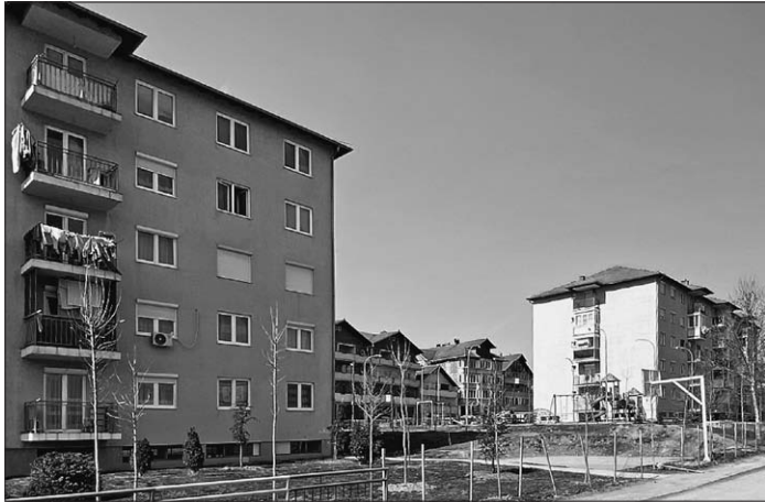
FIG. 6 SOCIAL HOUSING IN PRISTINA, KOSOVO