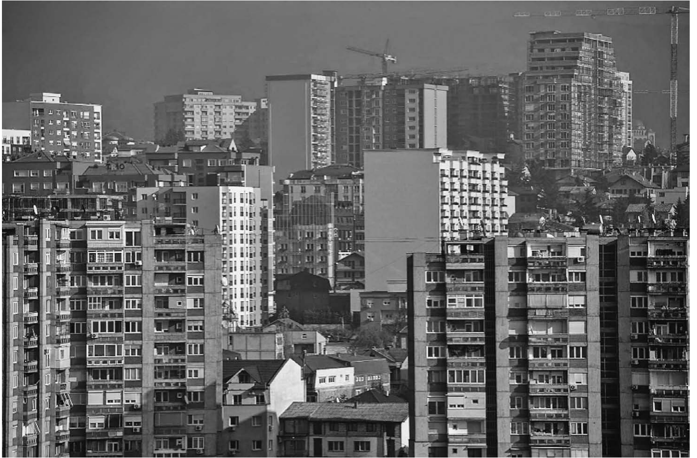
FIG. 1 RESIDENTIAL BUILDINGS IN PRISTINA, CAPITAL CITY OF KOSOVO