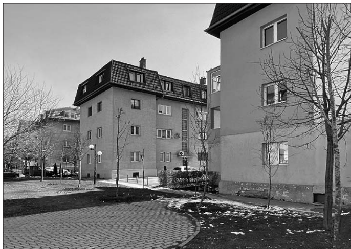
FIG. 2 FIRST MULTI-FAMILY HOUSING IN PRISTINA, 1947

the housing cost overburden is relatively low in many Northern European and Central/Eastern European (CEE) countries, it is high in Germany, Denmark and Bulgaria, and the problem is particularly acute in Greece and some Balkan countries (Caturinas et al., 2020).