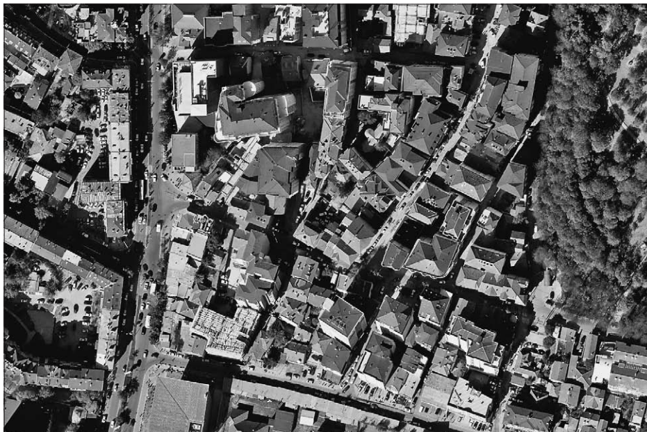
FIG. 8 ORTHOPHOTO OF NEIGHBOURHOOD “DODONA”, MOST OF THE RESIDENTIAL BUILDINGS ARE ILLEGAL CONSTRUCTIONS, PRISTINA, KOSOVO, 2021

ence in the treatment of housing policies between Kosovo and developed European countries. A significant element is the cost of investing in housing policies. According to the data in Europe, the cost of financing by GDP varies from country to country, but it is the lowest in Kosovo. This reduces the development of housing policies, as research shows that investment is a key element for improving housing standards and proper planning.