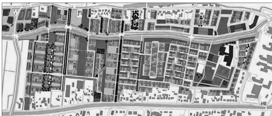
FIG. 4 MASTERPLAN OF LANGERAK, LEIDSCHIE RIJN, NETHERLANDS

Since European countries use policies that they develop at central level, there are mechanisms for improving housing policies. The majority of countries have a national housing strategy in place. 2 Funds are another important parameter that affect the quality of housing. Of course, investment is not the only way that governments can influence housing outcomes, with regulation being just as important. In this respect, a plethora of reforms have been adopted across Europe in recent years, related to many different areas from the reform of housing benefit schemes (for instance in France), the target group for social housing (the Netherlands), planning regulation (United Kingdom) and many more (Housing Europe, 2021: 6). According to The Organisation for Economic Co-operation and Development (OECD) 3 , governments need to invest in social and affordable housing in order to provide housing for all, as well as to maintain and renovate existing stock. New constructions must have a suitable location. Therefore, plans, regulations, land use and zoning must be continuously reformed (Fig. 4). Investing in urban renewal strategies improves the quality of neighbourhoods, increases overall access to jobs and services, and reduces spatial segregation (OECD, 2021). Governments should include housing as part of inclusive development, improving the quality of housing and neighbourhoods.