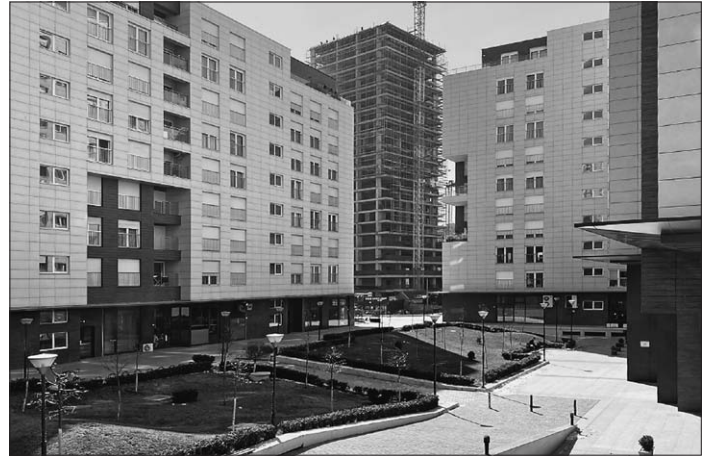
FIG. 7 COLLECTIVE HOUSING IN PRISTINA, KOSOVO, BUILT IN 2017

nisms. 5 The funds collected from rents were used for building maintenance, as well as for the construction of new housing, but they were not even sufficient to cover the basic costs of repairs (Jelinić, 1994). The construction of public housing faced a crisis in the 1980s, due to the lack of financial resources resulting from a generally weakening economic situation in Yugoslavia. However, it is also known that the socialist system created new urban inequalities through inappropriate housing policies and unfair distribution of public housing, which resulted in social division (Szelenyi, 1983, cited in: Spevec and Bogadi, 2009: 457). With the partition of the former Yugoslavia, when Kosovo became part of Serbia, riots broke out; the policies of that time also affected the housing market because the government tended to differentiate societies. This period of privatization continued until 1999, when the 1998-1999 conflict broke out. Because of the war in 1998 and poor housing policies before and after the war, the housing problem in Kosovo has been rather severe (Sylejmani, 2018: 30).