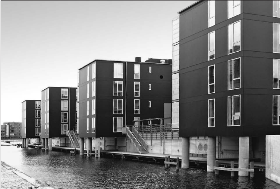
FIG. 9 NEW SOCIAL HOUSING IN SLUSEHOLMEN AND PREFABRICATED UNITS IN COPENHAGEN'S CENTRAL AREAS, DENMARK

number of buildings, market competition, the applicability of laws and many other factors have contributed to improving the quality of housing in co-ownership. In recent years we can find good examples of multi-family housing construction in Kosovo, which meet not only the functional aspect of housing, but can be categorized as buildings that meet the current requirements of quality housing based on European standards. However, the urban issues such as: traffic, infrastructure, parking spaces, green spaces, pedestrian and cycling paths, recreational spaces are important elements that influence the quality of housing in Kosovo.