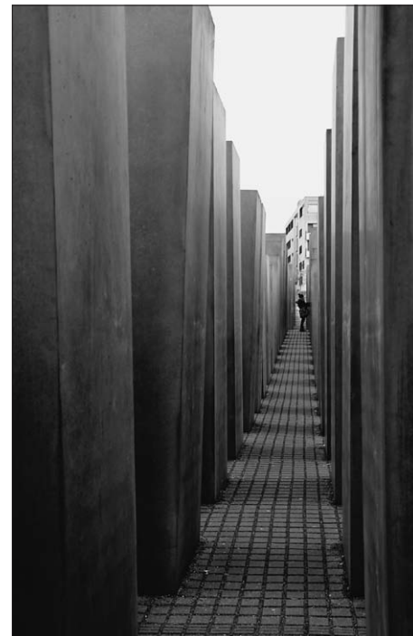
FIG. 8 VISITORS ALONG THE PATHS

The theory of allegory, as presented in The Origin of German Tragic Drama (1928), emerges from the playwrights and scenographers’ attempt to “merge the temporal dimension of the narrative word with the spatial extension of the allegorical image into a singular theatrical experience” (Osman, 2005: 122). I argue