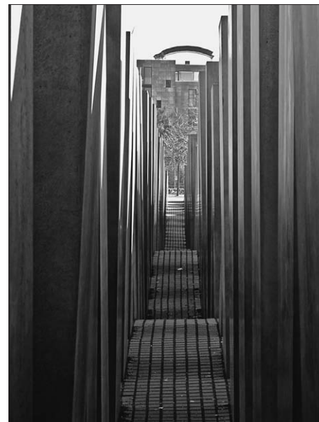
FIG. 6 THE VIEW ALONG THE PATH BETWEEN CONCRETE STELAE MOVING FROM OUTSIDE TO INSIDE

In the Jewish Museum Berlin, Libeskind has built several claustrophobic spaces along three axes, so visitors are never where they think they are. They know that the door at the end of the corridor should lead them outside, but the compact arrangement of walls does not allow them to breathe fresh air yet. The site slopes steeply from the entrance alongside cold grey surfaces. When they finally reach outside to the Garden, the height and proximity of the concrete columns make the