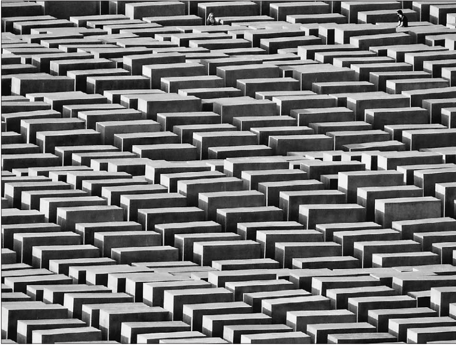
FIG. 4 THE AERIAL IMAGE OF THE 2,711 CONCRETE SLABS WITH VARIED HEIGHTS

leads to the Garden consisting of 49 concrete pillars or stelae – a Greek term for a slab or upright stone used as commemorative markers in ancient times. Seven meters high, the monolithic pillars rise out of a 7-by-7-meter square plot, each spaced a meter apart. The whole garden is on a 12° gradient, and the slanted columns raise perpendicular to this tilted floor. They are arranged in a square of seven rows of seven pillars (Sodaro, 2013). Forty-eight columns are filled with the earth from Berlin, signifying the birth of the state of Israel in 1948, and the forty-ninth, at the center, stands for Berlin and is filled with earth from Jerusalem (Young, 2000: 18). Olive branches grow from the pillar tops, forming a green canopy over the garden. 2