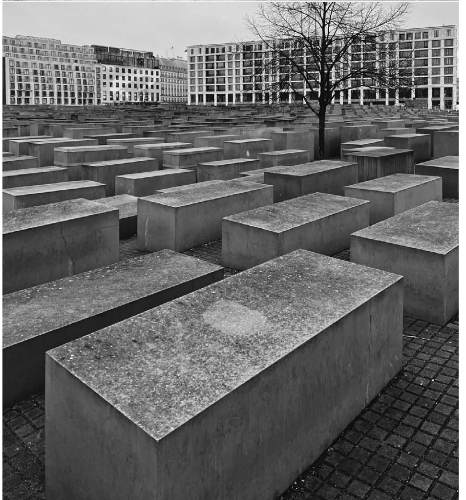
FIG. 1 THE GARDEN OF EXILE FROM JEWISH MUSEUM BERLIN