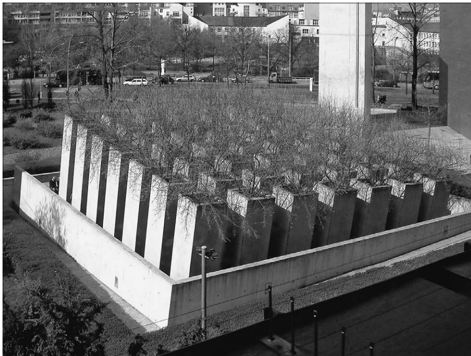
FIG. 5 THE TILTED CONCRETE STELAE AND THE VEGETATION GROWING WITHIN

Despite the difference in scale between this Garden and the Memorial for the Murdered Jews of Europe, it is still possible to point out similar design ideas. The pillars in Eisenman's monument form the upper plane at eye level and stretch between two undulating grids. Although the difference between the ground plane and the top plane may appear random and arbitrary at first, a matter of pure expression, this is not the case. All planes are determined by intersection of the voids on the pillar grid. A field of calculated instability