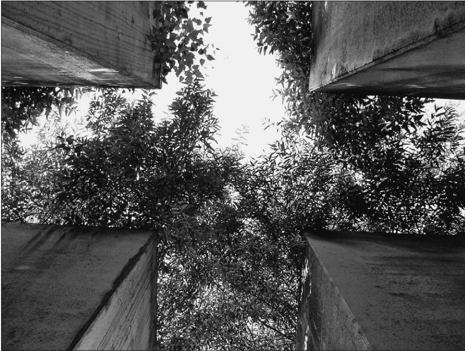
FIG. 7 THE VIEW LOOKING UP FROM THE GARDEN OF EXILE

trees unobtainable. However, the green covering the sky creates an imaginary cloud and isolates the visitors from the outside (Fig. 7). Moving through this environment is difficult without familiar horizontal and vertical reference points. Only a glimpse of faraway buildings is level in this new world. Rhythms of spatial compression and release characterize the architecture of Libeskind's writing-pad. It creates an interplay of perspective and close-up where the Gestalt between columns directs one's attention to the scale of the columns, and thus the columnar organization performs an interplay of tactile and optical illusions. Simultaneously, the sloping ground is disorienting and makes one feel nauseous, like being on a boat – a physical sensation of how unsettling it is to be culturally adrift/in exile. It is also an appropriate metaphor for what Libeskind calls the “shipwreck of history” (1990). Moreover, the Museum and this garden speak to visitors kinesthetically, and wandering bodies feel a deliberate sense of rootlessness.