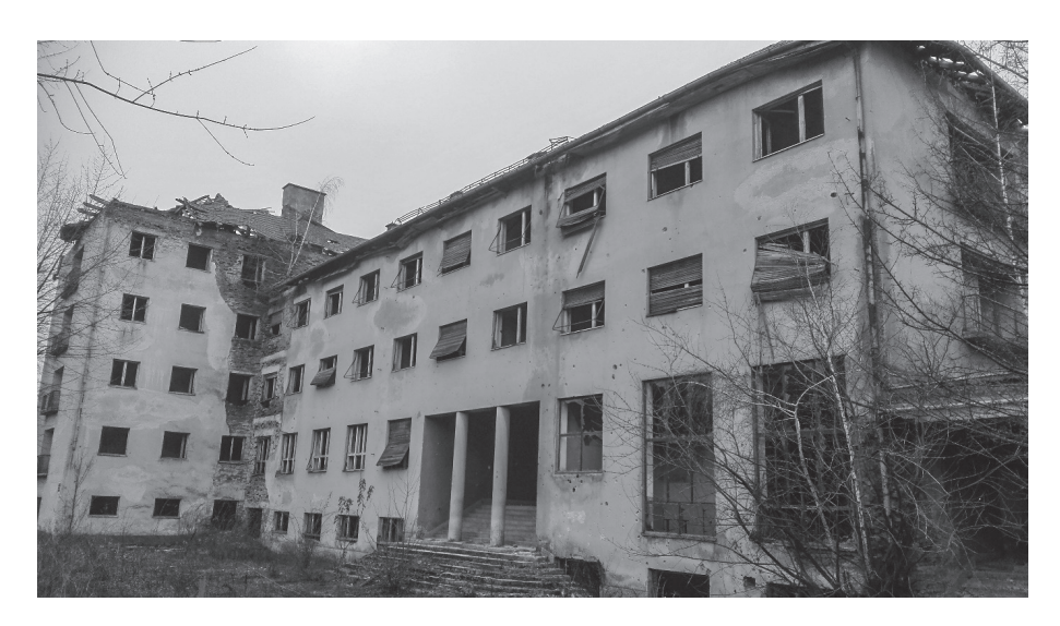
Fig. 5. Hotel Lički Osik, present situation. Photo: I. Brlić (December 1, 2018)