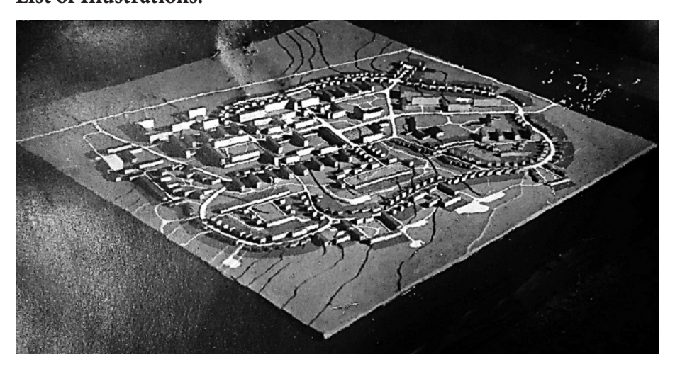
Fig. 1. Model of a possible planned city in the cadastral municipalities of Lički Osik and Široka Kula.