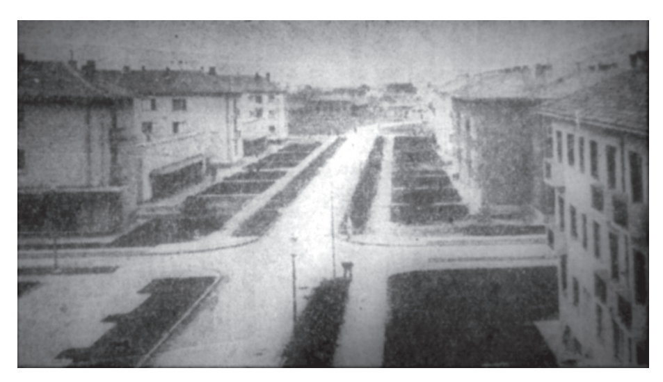
Fig. 4. View from Hotel Lički Osik towards Boris Kidrič Street in 1958.