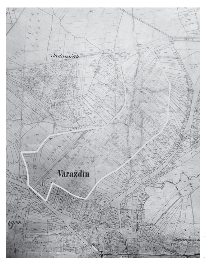
Varaždin cadastral parcels owned by the Erdödy family<sup>42</sup>