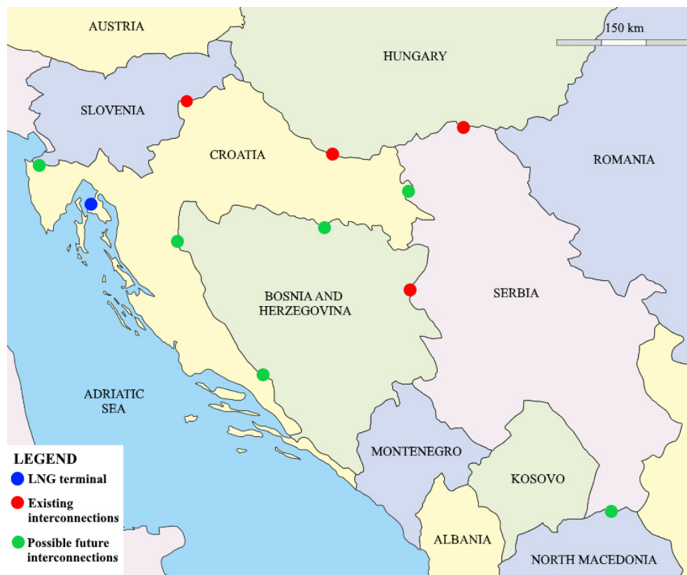
Figure 1: Existing and possible future interconnections in the region.

evacuation pipeline, it is also necessary to increase the capacity of transport routes to other countries in the region in order to allow natural gas exports. Because of this, it is necessary to build the following pipelines ( Plinacro, 2017 ):