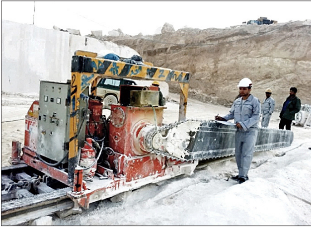
Figure 3: Chainsaw cutting machine was used in the case study quarries.

an mine had the highest such production rate in more than 65% of operating conditions compared to the other two faces from this mine.