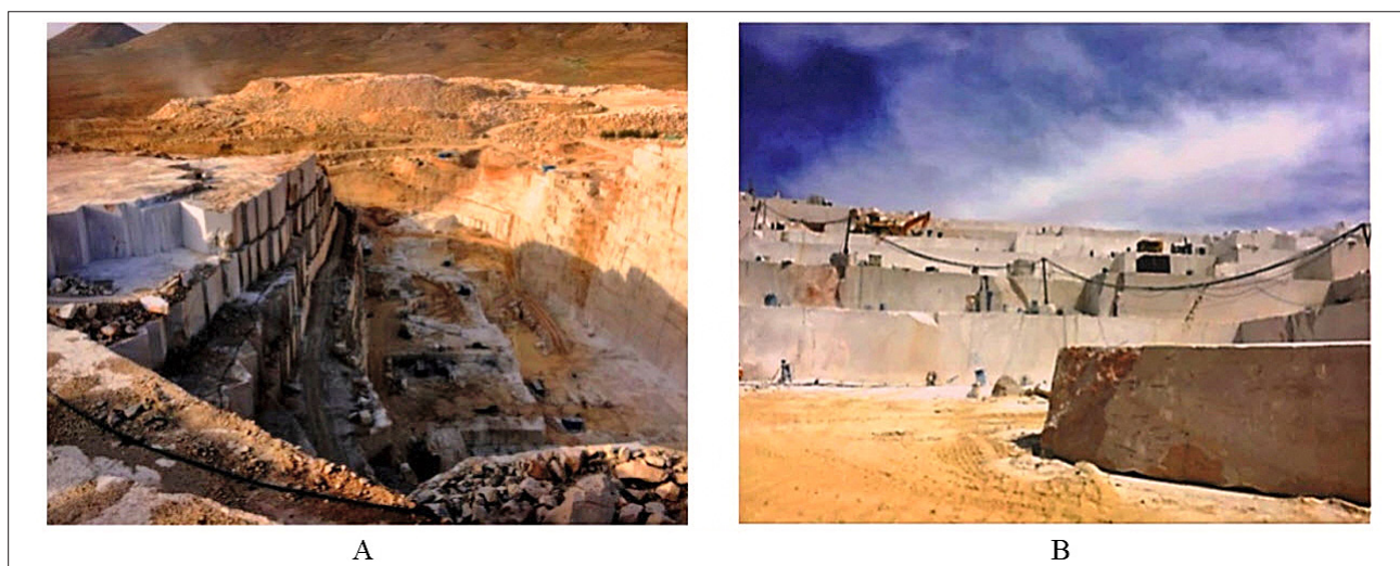
Figure 2: Dehbid Marble Mine (A) and Shayan Marble Mine (B).