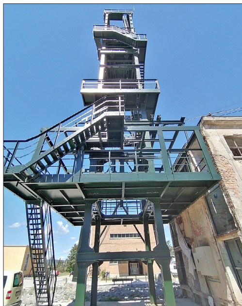
Figure 7: Mine shaft in Labin

Coal mining in Istria ceased in the early 1990s. The local community still has a strong memory of this industry, and many of its historical artefacts have remained on the peninsula. Some towns like Labin (see Figure 7 ) are heavily marked by them.