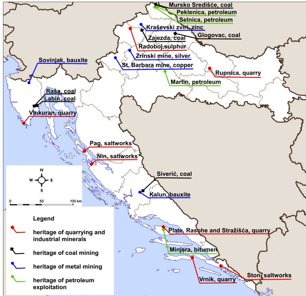
Figure 2: Map of Croatian geotechnological heritage