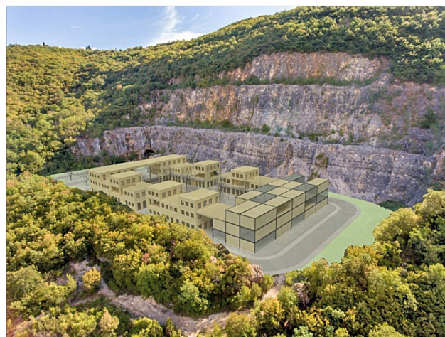
Figure 8: Memorial center Karlota in Raša, architectural visualization (by “Arhitektonsko-građevinski atelje” d.o.o.)

The future project Memorial Center Karlota in Raša ( URL10 ) can be included in the spatial revitalization and presentation plan of the entire mining area around the town of Labin. With regard to the authenticity of the architectural and urban heritage of the mining town of Raša, the concept of the Memorial Centre of European Totalitarisms, situated in the nearby abandoned quarry of Karlota (see Figure 8 ), is based upon the idea of presenting the “spirit of the place” (lat. genius loci), or the identity of place, through a new complex with a specific architecture and urban design. The abandoned quarry Karlota has proven to be an ideal location for many reasons. It is situated in the immediate area surrounding Raša, on an elevated terrain with great views over the town’s historical structures. There is a plateau amidst the rock wall with a surface area of about 13 900 m 2 , which meets all the requirements for the complex disposition.