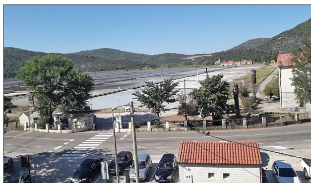
Figure 5: Saltworks in Ston

fining machine known as the “Radoboj machine” was invented and used for the first time in Radoboj ( Kišpatić, 1878 ) which has contributed to the importance of the mining heritage. Today, this sulfur mine does not exist anymore (see Figure 6 ). Therefore, only old documents and an essential fossil collection prove the importance of the geological and mining heritage of this area. Due to the exceptional importance of mining and sulfur exploitation in the Radoboj area, the Radboa Museum was opened ( URL5 ). The museum was partly funded by European funds and represents a good example of connect-