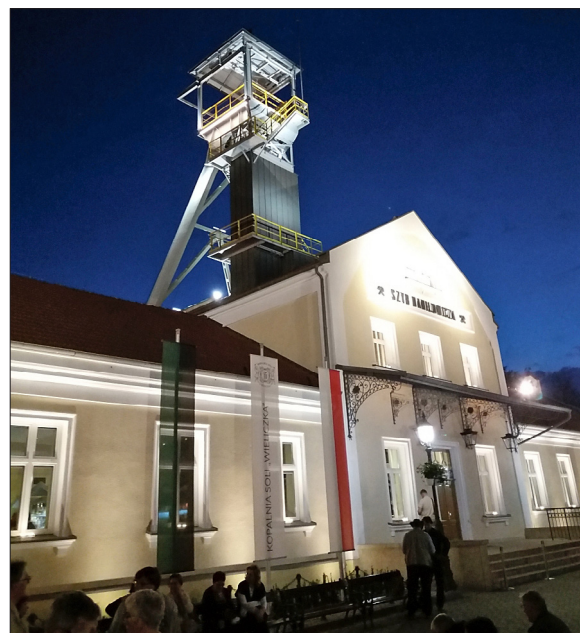
Figure 1: Salt mine entrance in Wieliczka

There are many examples of the successful conservation and revitalization of mining heritage sites in the European Union. In some classical cases, old mines formerly used for the extraction of salt have been revitalized. Traditionally, this is the case of Salzburg or the famous Wieliczka salzmine near Krakow (see Figure 1). Wieliczka is the most popular visitor mines in the world and one of the most visited tourist attractions in Poland. It is marked as the first of the mining objects and regions in the world on the UNESCO World Heritage List (URL1). Comparing the number of visitors, it ranks higher than the Austrian Hallstatt, which is probably the oldest salt mine in the world. The history of salt mining dates back to the Middle Bronze Age and it is related to the Swedish Falun (which once belonged to the most im-