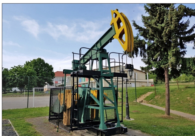
Figure 12: Selnica petroleum heritage park (by Brkić, V.)

roleum shaft (Velić et al., 2012), from which oil was being extracted in the period from 1854 to 1943 (see Figure 13). The 72-meter-deep Martin shaft was once the largest in the Austro-Hungarian Empire. Oil was even used to illuminate the city of Vienna (Novak-Zoro, 2013).