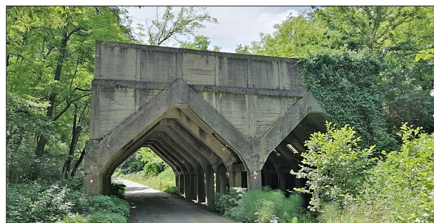
Figure 10: Remains of a coal loading bunker in Glogovac (by Briševac, Z.)

Some historical details have shown that the first underground coal mine in Međimurje was opened in Peklenica on June 5, 1870 (Mesarić, 2015). The exploi-