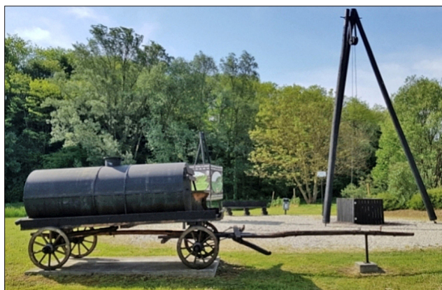
Figure 11: Peklenica petroleum heritage park