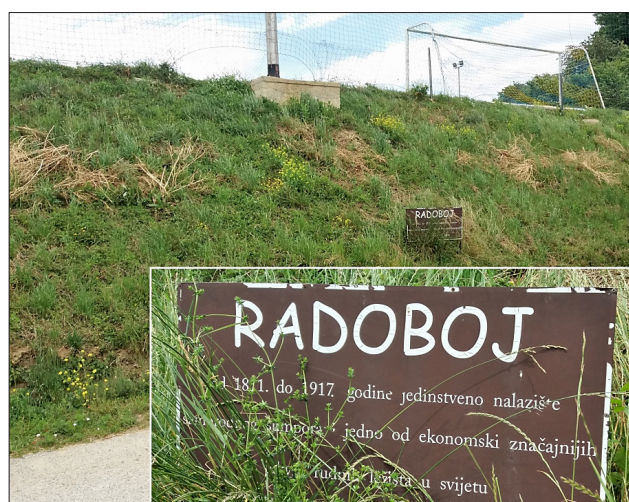
Figure 6: Marking of the place where the sulfur mine was (by Briševac, Z.)

fining machine known as the “Radoboj machine” was invented and used for the first time in Radoboj ( Kišpatić, 1878 ) which has contributed to the importance of the mining heritage. Today, this sulfur mine does not exist anymore (see Figure 6 ). Therefore, only old documents and an essential fossil collection prove the importance of the geological and mining heritage of this area. Due to the exceptional importance of mining and sulfur exploitation in the Radoboj area, the Radboa Museum was opened ( URL5 ). The museum was partly funded by European funds and represents a good example of connect-