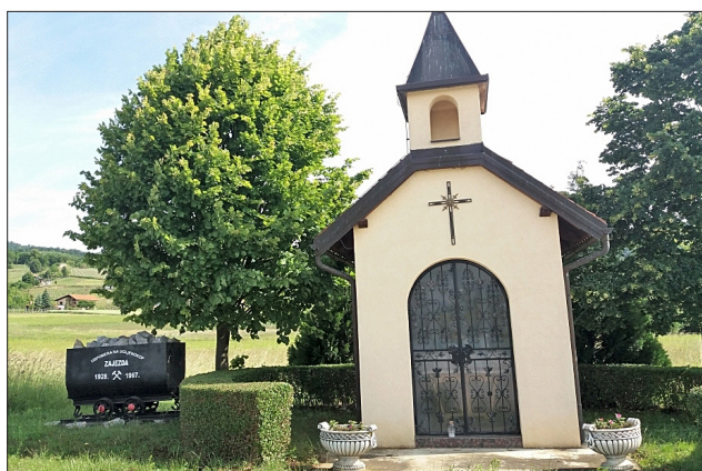
Figure 9: Chapel of St. Barbara and the Monument to the Zajezda Mine (by Briševac, Z.)

since the 1890s. It was one of the oldest and largest lignite coal mines in the local area (Petrić, 2013). Today, mining buildings together with industrial remains such as a mining separator, have a huge potential for revitalization. There have also been some initiatives and actions, but many of them are going to be taken into account by the Tourist Office Ivanec (Jagetić Daraboš, 2017) within next steps of the revitalization process. On the opposite side of Ivanec, namely in the southern part of the mountain Ivančica, the Konjščina basin coal mines were equally developed. A representative monument of the mine is set in Zajezda (Budimština municipality) and it is located next to the chapel of St. Barbara (see Figure 9). The local mine in Zajezda existed from 1928 to 1967. The inspiration for the construction of the mine in the Technical Museum Nikola Tesla in Zagreb stems from the Konjščina mine.