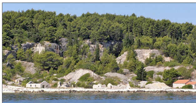
Figure 4: Remains of the old quarry on the Vrnik islet near Lumbarda (by Maričić, A.)

In addition, sulfur of excellent quality was being extracted in Radoboj in the past. The sulfur mine was opened in 1811 ( Bićanić, 1951 ). Many plant fossils, insects and fish were found there, and they all represent an exceptional ex-situ geological heritage ( Mileusnić et al., 2019 ). Among many fossils it is important to mention the famous and the oldest found leaf of a vine ( Vitis teutonica ) and many fossil insects, such as ants, flies, and leaf bugs ( Kozina, 2014 ). Additionally, a sulfur re-