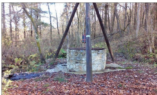
Figure 13: Martin petroleum shaft (by Brkić, V.)

roleum shaft (Velić et al., 2012), from which oil was being extracted in the period from 1854 to 1943 (see Figure 13). The 72-meter-deep Martin shaft was once the largest in the Austro-Hungarian Empire. Oil was even used to illuminate the city of Vienna (Novak-Zoro, 2013).