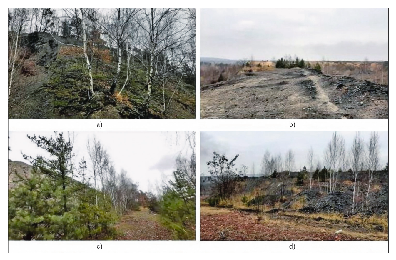
Figure 2: Natural phytomelioration of the Nadiya mine rock dump: a) from the south near the foot involving a drooping birch ( Bétula péndula ); b) from the north on the slope terrace involving a common pine ( Pinus silvestris ); c) from the east near the foot; d) on top.

erosion) outlets, fire sites, fuel and lubricant discharge sites, and domestic discharge sites. Soil density is increasing, which has led to an almost complete cover of grass on the ground. The herbaceous cover is represented by isolated groups of Poa angustifolia L.. Among the trees are Betula pendula Roth. (2-6) m, and Pinus sylvestris L. (1-3) m. The projective herbaceous cover is 10-15%, trees – 20-30%.