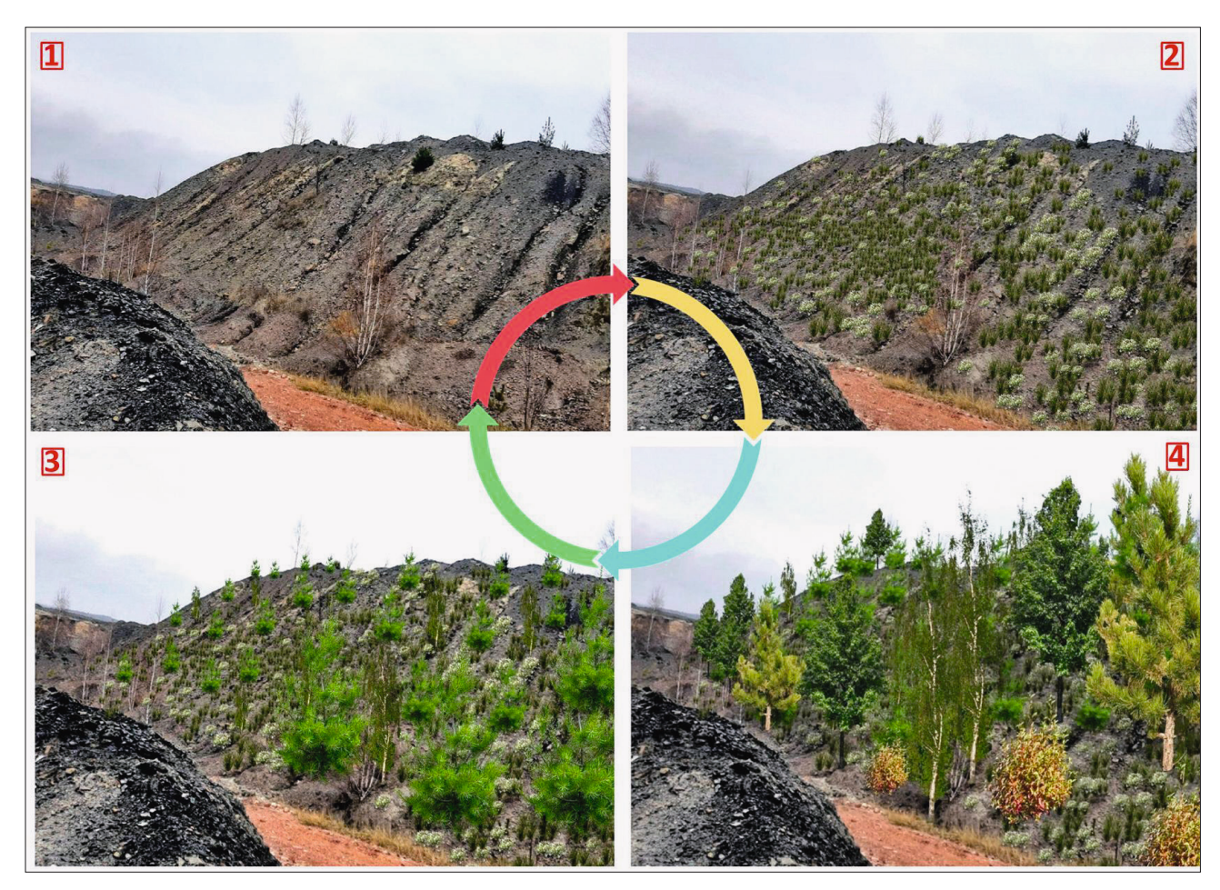
Figure 3: Projective vegetation cover of a devastated slope: 1) current state before the beginning of phytomeliorative process; 2) for the 3rd year of the phytomeliorative process; 3) for the 5th year of the phytomeliorative process; 4) for the 10th year of the phytomeliorative process.

soil conditions and have increased growth and development energy, as well as a branched root system.