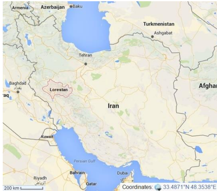
Figure 1. Geographical location of the Lorestan province

Through the advancement of human knowledge, the need for precise and scientific decision making while keeping in mind its sensitive nature, new decision making methods including Multi Attribute Decision Making (MADM) could find a suitable position in mining engineering. A selection of haulage equipment, Mining Method Selection (MMS), coal type ranking, support system selection, loading equipment choice, road header selection, ranking of risks in mines and ventilation assessment using new MADM or statistical methods of risk assessment have replaced traditional methods (Bazzazi et al. , 2011; Hekmat et al. , 2008; Lashgari et al. , 2011; Lashgari et al., 2012; Lashgari et al. , 2010; Mikaeil et al. , 2009; Yari et al. , 2015; Yari et al. , 2015; Yari et al. , 2013; Yari et al. , 2014; Yari et al. , 2015; Yarahmadi et al. , 2014).