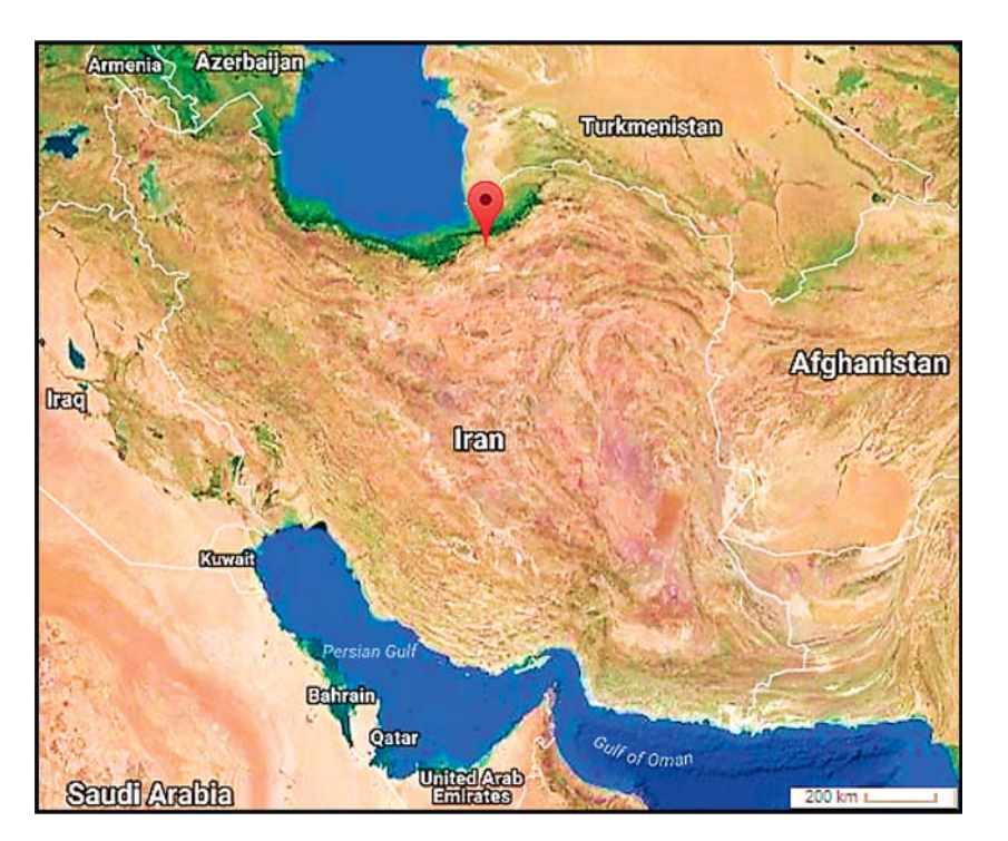
Fig 3: Location of the Tazareh coal mine