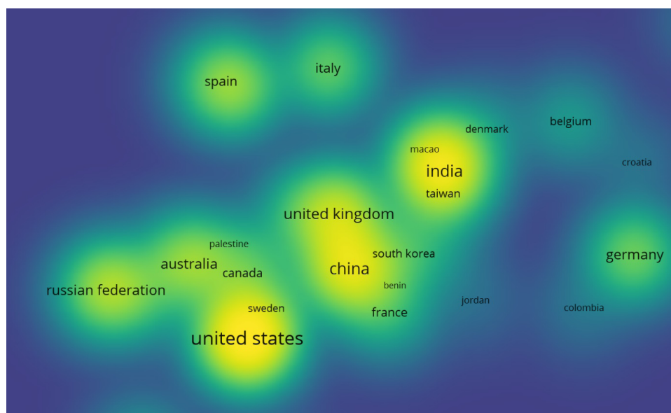
Figure 1. The highest concentration of scientific papers and citations in the SCOPUS database