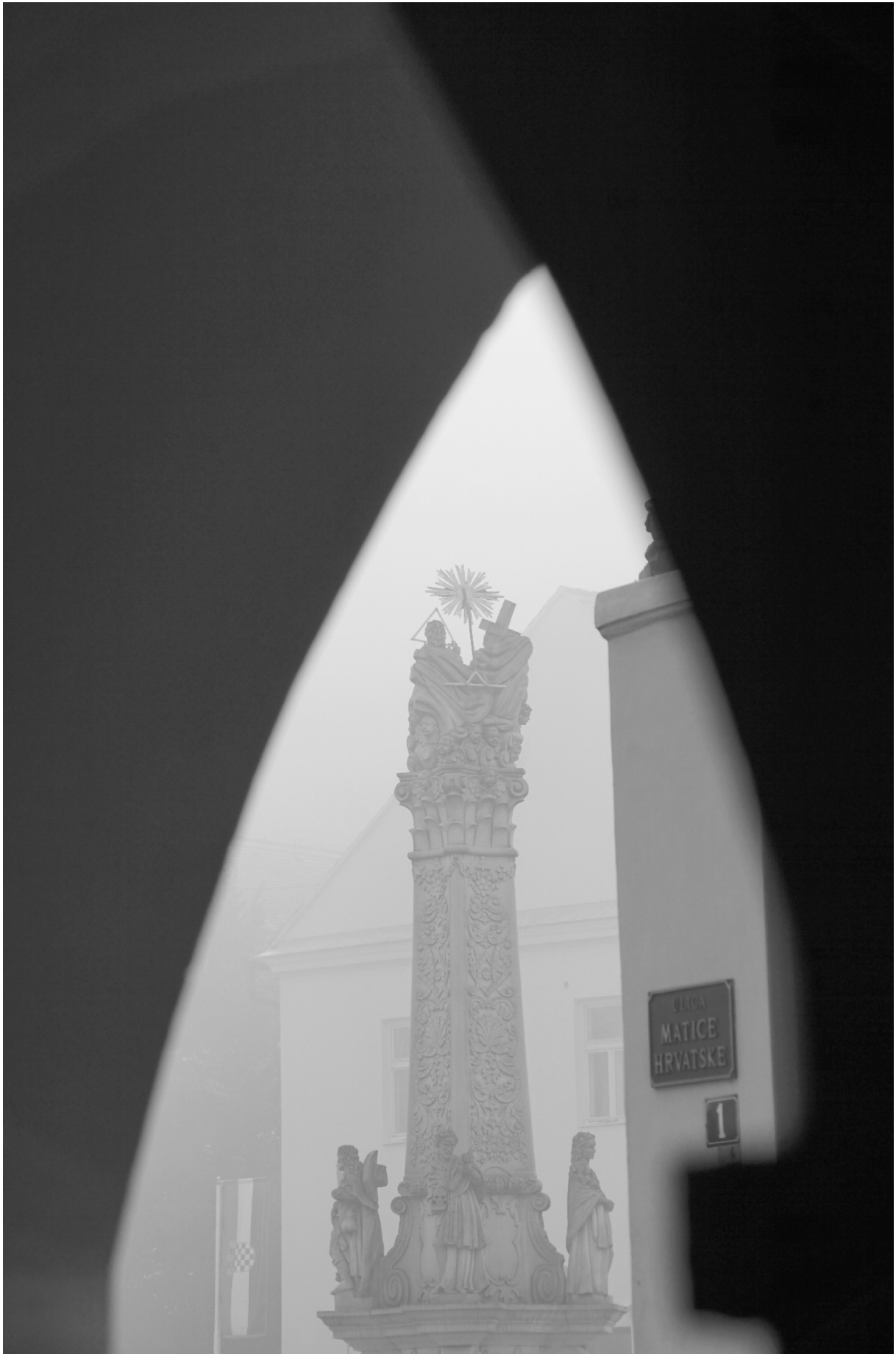
Photo 003. Plaque monument / Kužni pil - Požega