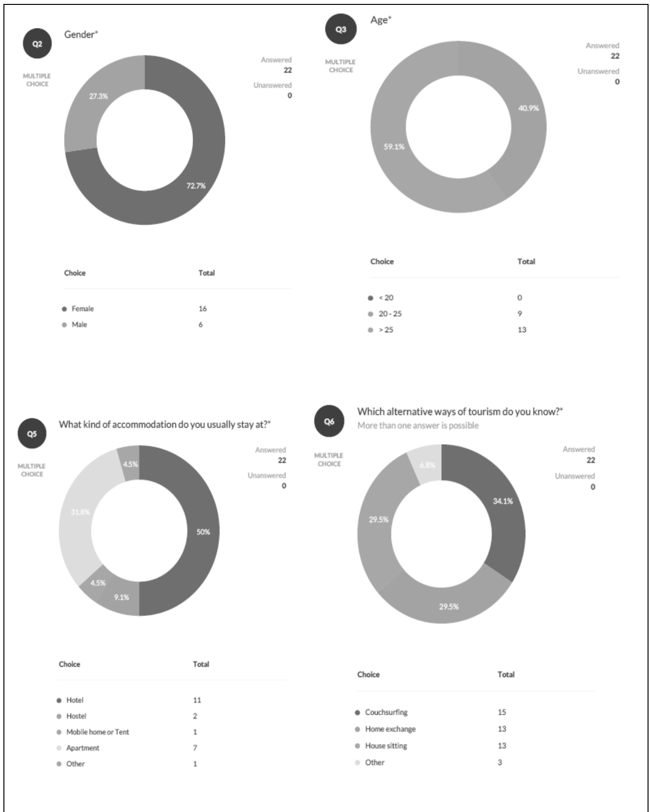
Picture 1. Demography and tourist behaviour