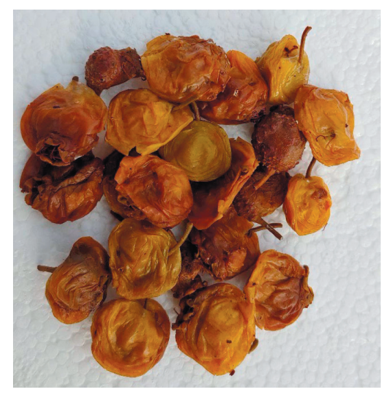
Fig. S1. Dried mayhaw berry waste as received