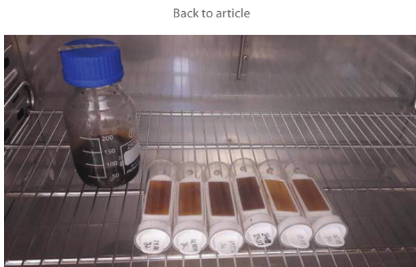
Fig. S3. Concentrated grape extract and uncontaminated dip slides